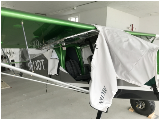
Rans S-7 Courier Canopy Cover (Over-The-Top Style), Belly Strap Type, Lsa Model (S7-S)

This cover type is made from Silver Acrylic Sunbrella canvas and is 100% lined with a soft and smooth microfiber. Bruce's Custom Covers developed this material combination especially for aircraft protection. The outer material is medium weight and treated for water resistance, UV resistance and anti-static buildup. The inner lining is a very soft and smooth microfiber to prevent scratching. The material is very reflective, and tests show that the cabin interior temperature can be reduced to near-ambient temperature on the hottest of days. It is water, ice and snow repellent, yet breathable to allow moisture to escape from between the cover and the aircraft surface.