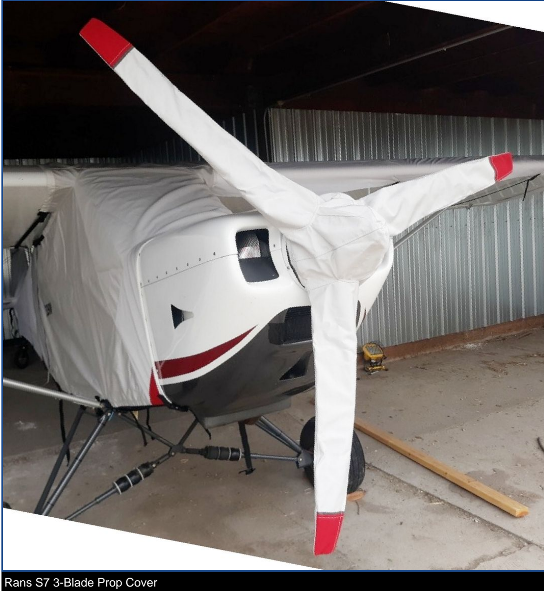
Rans S7 3-Blade Prop Cover