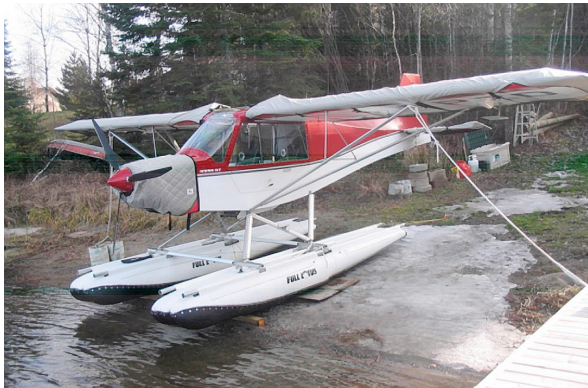
Rans S-7 Insulated Engine, Wing and Horizontal Stabilizer Covers

WINTER USE MATERIAL - Made with Solution-Dyed Polyester fabric, this option is intended for seasonal use to aid in deicing, rain mitigation, or for occasional travel. The material is lighter and more compact, but more susceptible to UV damage and may have a shorter useful life if used continuously outside than the all-year use material.