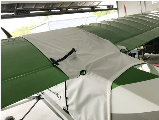
Rans S-7 Courier Canopy Cover (Over-The-Top Style), Belly Strap Type, Lsa Model (S7-S)