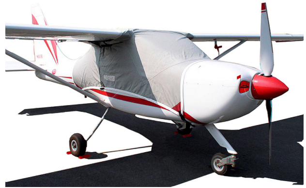
Glastar Over-Top Canopy Cover