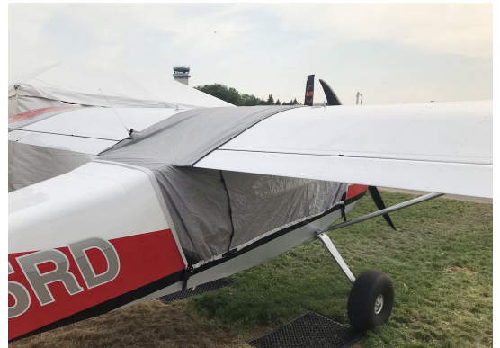
Rans S-21 Travel Canopy Cover