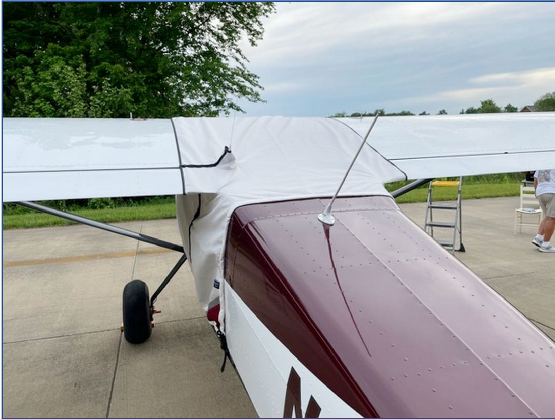
Rans S-21 Outbound Canopy Cover