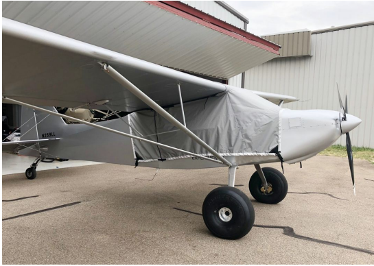
RANS S20 TRAVEL COVER