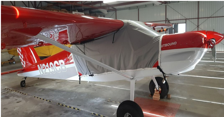
RANS S-21 Travel Weight Canopy Cover

Travel Covers are made with Silver Solution-Dyed Polyester fabric and only lined over the windshield to save weight. The material is lightweight and more compact for easy stowage in the aircraft. The polyester material is water resistant, but only intended for occasional use outside. We also have an ultra lightweight material available for fitted hangar dust covers. For daily outdoor use, the non-travel Sunbrella Cover is the best choice.