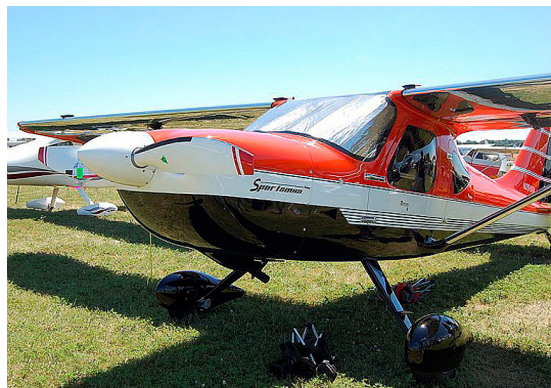
Glastar Sportsman Windshield HeatShield

Windshield Heatshields are interior sunshades for an aircraft's front windshield. The product is a unique composite of closed-cell foam with a silver mylar finish. The semi-rigid design is stiff enough to stand along the inside of the windshield using sun visors or window framing. It folds up flat and easily stores in the included storage sleeve. Some designs may require velcro and suction cups or split right and left sides. A Heatshield is an excellent short-term remedy for cockpit overheating. An external fabric cover is far more effective and practical for long-term protection.