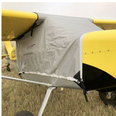
Rans S-20 Raven Travel Cover, Light Weight Travel Canopy Cover

Travel Covers are made with Silver Solution-Dyed Polyester fabric and only lined over the windshield to save weight. The material is lightweight and more compact for easy stowage in the aircraft. The polyester material is water resistant, but only intended for occasional use outside. We also have an ultra lightweight material available for fitted hangar dust covers. For daily outdoor use, the non-travel Sunbrella Cover is the best choice.