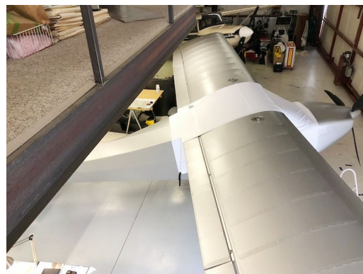
Rans S-20 Canopy Cover, test fit cover