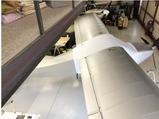
Rans S-20 Canopy Cover, test fit cover

This cover type is made from Silver Acrylic Sunbrella canvas and is 100% lined with a soft and smooth microfiber. Bruce's Custom Covers developed this material combination especially for aircraft protection. The outer material is medium weight and treated for water resistance, UV resistance and anti-static buildup. The inner lining is a very soft and smooth microfiber to prevent scratching. The material is very reflective, and tests show that the cabin interior temperature can be reduced to near-ambient temperature on the hottest of days. It is water, ice and snow repellent, yet breathable to allow moisture to escape from between the cover and the aircraft surface.