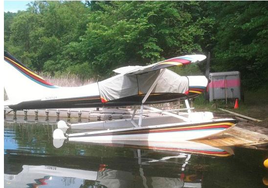
Glastar Sportsman Canopy Cover