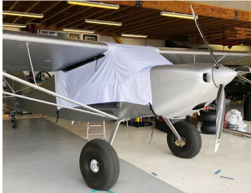
Rans S-20 Canopy Cover, test fit cover

This cover type is made from Silver Acrylic Sunbrella canvas and is 100% lined with a soft and smooth microfiber. Bruce's Custom Covers developed this material combination especially for aircraft protection. The outer material is medium weight and treated for water resistance, UV resistance and anti-static buildup. The inner lining is a very soft and smooth microfiber to prevent scratching. The material is very reflective, and tests show that the cabin interior temperature can be reduced to near-ambient temperature on the hottest of days. It is water, ice and snow repellent, yet breathable to allow moisture to escape from between the cover and the aircraft surface.