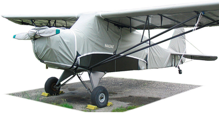
Prop Cover, Engine Cover, Canopy Cover, Wing Covers and Empennage Cover

WINTER USE MATERIAL - Made with Solution-Dyed Polyester fabric, this option is intended for seasonal use to aid in deicing, rain mitigation, or for occasional travel. The material is lighter and more compact, but more susceptible to UV damage and may have a shorter useful life if used continuously outside than the all-year use material.