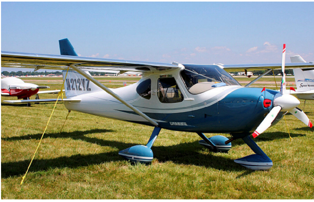
Glastar Sportsman Engine Inlet Plugs