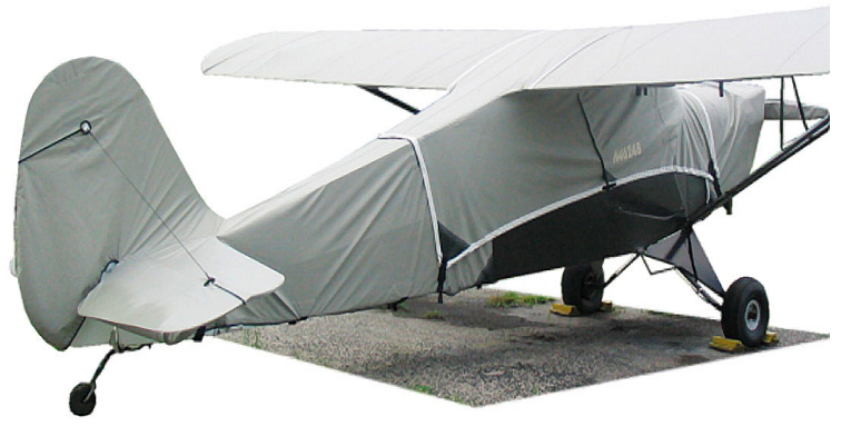
Taylorcraft L-2 Grasshopper Prop, Engine, Canopy, Wing and Empennage Covers