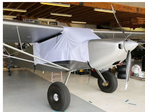
Rans S-20 Canopy Cover, test fit cover