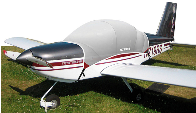
Rans S-19 Canopy Cover (illustration)