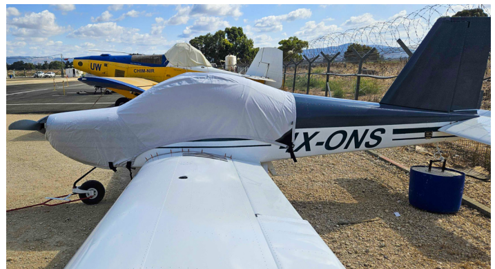
Rans S-19 Canopy/Engine Cover