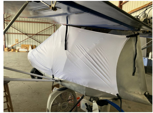
Rans S-12 Canopy/Nose Cover, test fit