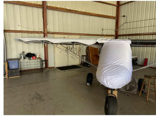
Rans S-12 Canopy/Nose & Wing Covers, test fit