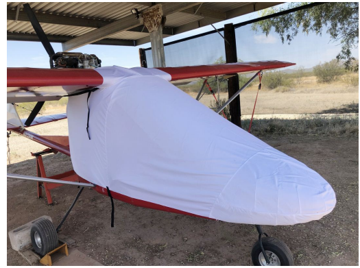
Rans S-12 Airaille Canopy/Nose Cover (test fit cover)