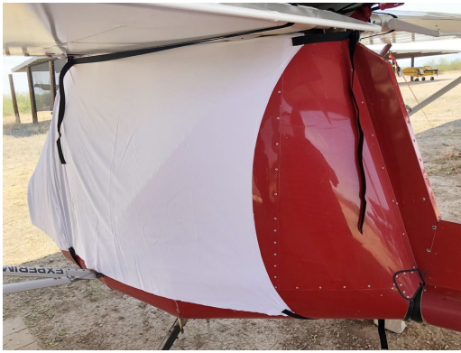
Rans S-12 Airaile Canopy/Nose Cover (test fit cover)