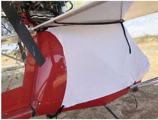
Rans S-12 Airaille Canopy/Nose Cover (test fit cover)