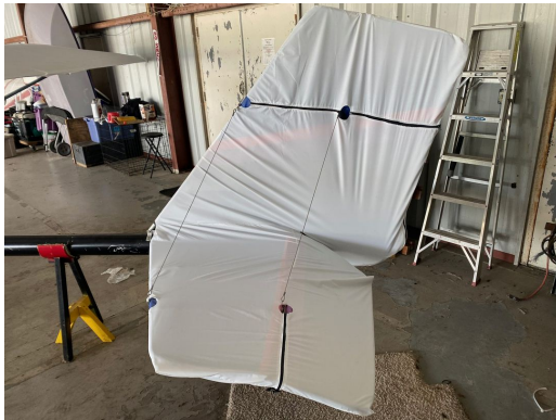
Rans S-12 Empennage Cover, test fit

WINTER USE MATERIAL - Made with Solution-Dyed Polyester fabric, this option is intended for seasonal use to aid in deicing, rain mitigation, or for occasional travel. The material is lighter and more compact, but more susceptible to UV damage and may have a shorter useful life if used continuously outside than the all-year use material.