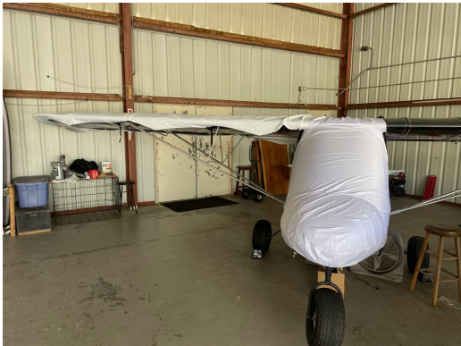
Rans S-12 Canopy/Nose & Wing Covers, test fit