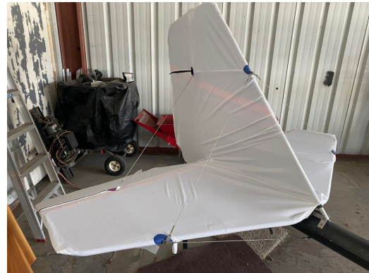
Rans S-12 Empennage Cover, test fit