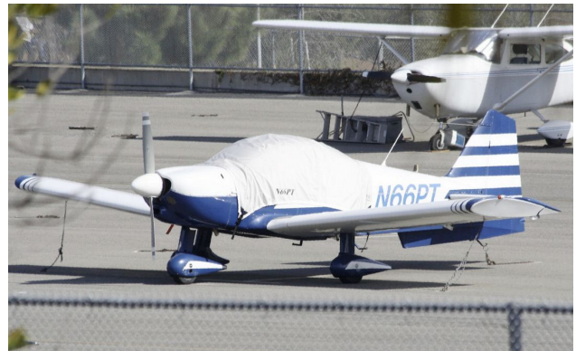
Robin R-2160 Canopy Cover with 12" forward Extension