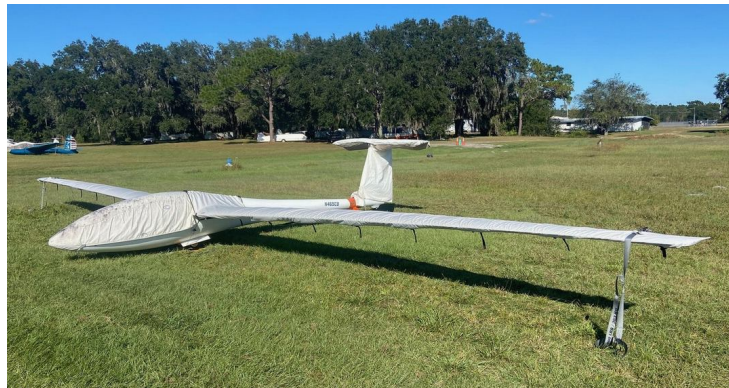
Rolladen-Schneider LS-4 Wing Covers

WINTER USE MATERIAL - Made with Solution-Dyed Polyester fabric, this option is intended for seasonal use to aid in deicing, rain mitigation, or for occasional travel. The material is lighter and more compact, but more susceptible to UV damage and may have a shorter useful life if used continuously outside than the all-year use material.