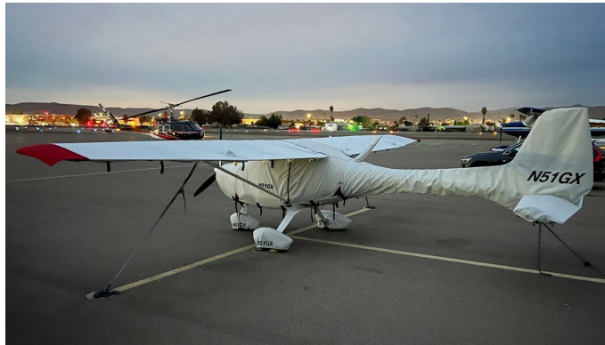
Remos RG-3 Complete Cover Set

ALL-YEAR USE MATERIAL - Made with Silver Acrylic Sunbrella canvas, the all-year use material is the best option for sun protection and cover longevity. This heavier more durable material is intended for all weather conditions, such as rain and snow or lots of sun.