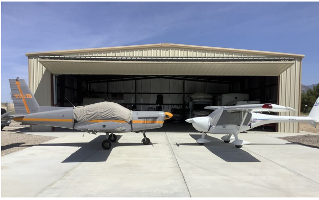
G-3/600 Travel Cover and Zlin 142 Canopy Cover