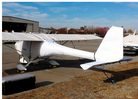
Remos Empennage Cover (test fit cover)