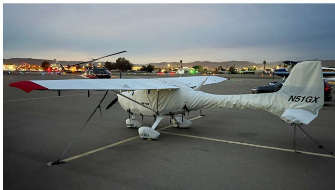
Remos RG-3 Complete Cover Set

WINTER USE MATERIAL - Made with Solution-Dyed Polyester fabric, this option is intended for seasonal use to aid in deicing, rain mitigation, or for occasional travel. The material is lighter and more compact, but more susceptible to UV damage and may have a shorter useful life if used continuously outside than the all-year use material.