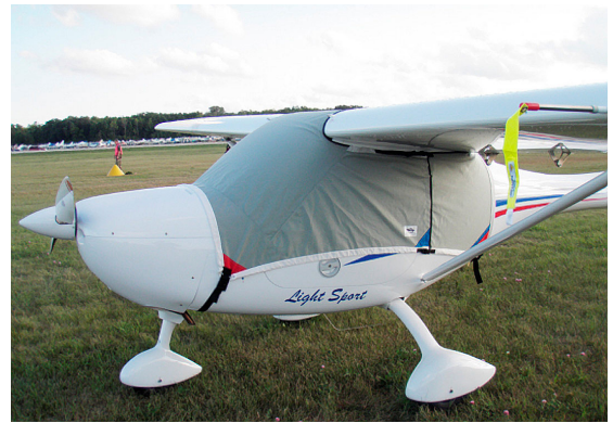
Remos G3 Travel Weight Canopy Cover