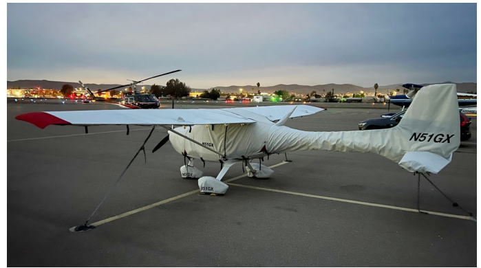
Remos RG-3 Complete Cover Set