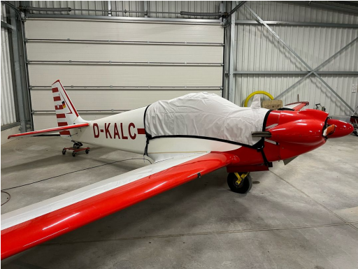
Fournier RF-4D Motorglider Canopy Cover