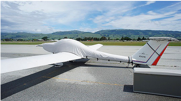
Grob 109 Canopy/Engine w/ extension to tail, Wing, Stabilizer & Prop/Spinner Covers