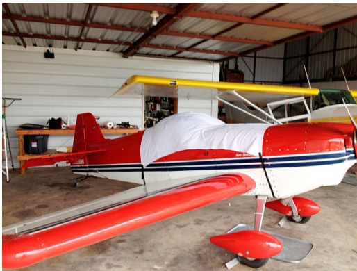
IAC One Design Canopy Cover, test fit cover

This cover type is made from Silver Acrylic Sunbrella canvas and is 100% lined with a soft and smooth microfiber. Bruce's Custom Covers developed this material combination especially for aircraft protection. The outer material is medium weight and treated for water resistance, UV resistance and anti-static buildup. The inner lining is a very soft and smooth microfiber to prevent scratching. The material is very reflective, and tests show that the cabin interior temperature can be reduced to near-ambient temperature on the hottest of days. It is water, ice and snow repellent, yet breathable to allow moisture to escape from between the cover and the aircraft surface.