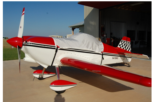
IAC One Design Canopy Cover