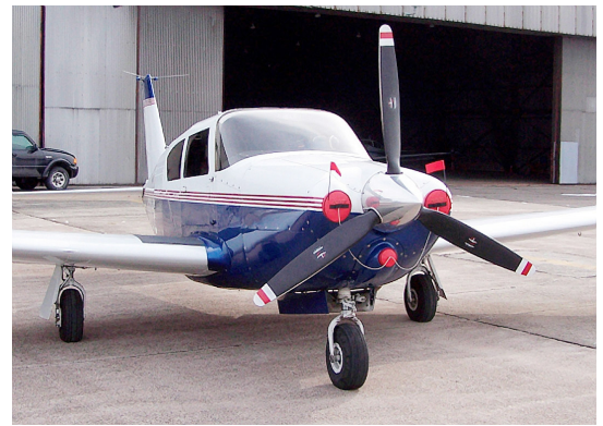
Piper Comanche Engine Plugs