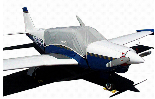
Piper Comanche Standard Canopy Cover & Engine Plugs