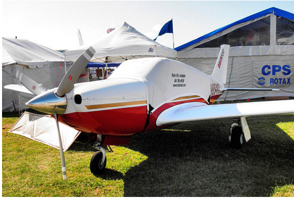
Ravin 500 Standard Canopy Cover

This cover type is made from Silver Acrylic Sunbrella canvas and is 100% lined with a soft and smooth microfiber. Bruce's Custom Covers developed this material combination especially for aircraft protection. The outer material is medium weight and treated for water resistance, UV resistance and anti-static buildup. The inner lining is a very soft and smooth microfiber to prevent scratching. The material is very reflective, and tests show that the cabin interior temperature can be reduced to near-ambient temperature on the hottest of days. It is water, ice and snow repellent, yet breathable to allow moisture to escape from between the cover and the aircraft surface.