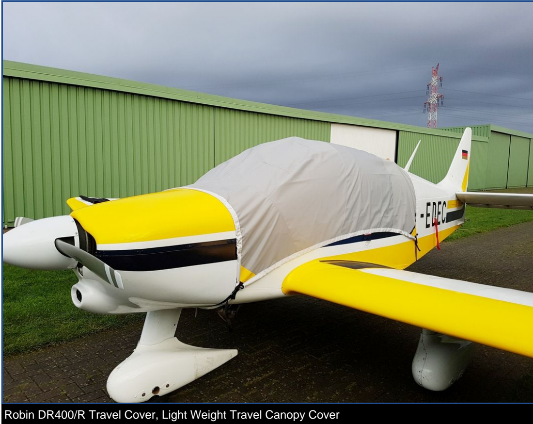
Robin DR400/R Travel Cover, Light Weight Travel Canopy Cover