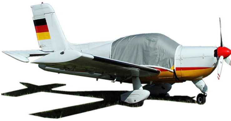
Rallye 150 Canopy Cover

the hottest of days. It is water, ice and snow repellent, yet breathable to allow moisture to escape from between the cover and the aircraft surface.