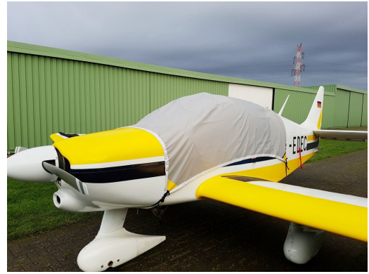
Robin DR400/R Travel Cover, Light Weight Travel Canopy Cover