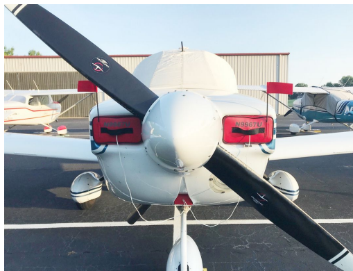
Grumman AA-5A Engine Inlet Plugs, Traveler models w/carb inlet plug (set of 3) on a

Engine Inlet Plugs are custom fit for your Robin 3140 & R-3000 intakes, made with heavy-duty vinyl material, and stuffed with a single block of sculpted urethane foam. Each plug has a zipper that allows the foam to be removed and dried if necessary. Engine plugs have warning flags that are visible from the cockpit or 'remove before flight' streamers sewn onto the face of the plugs. Most plugs are imprinted with the aircraft registration number in black for an extra charge. Storage bag NOT included. Engine plugs may be inserted after flight when the engine is still warm. Engine Inlet Plugs are commonly referred to as Cowl Plugs, Intake Plugs, Cowl Blocks, Engine Blocks, and Engine Bungs.