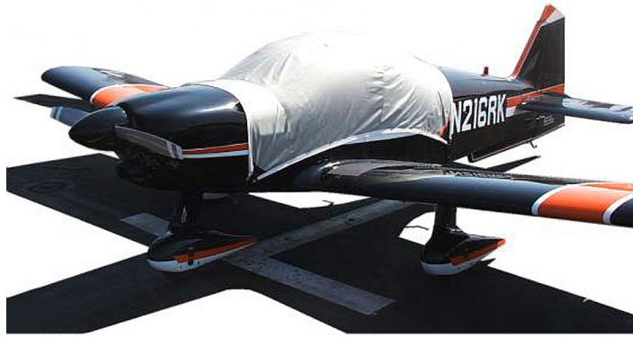
Robin R.2160 Canopy Cover