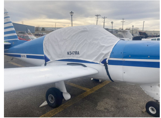
SOCATA Rallye 150 Canopy Cover