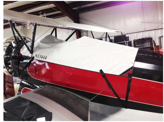
Waco QCF/UBF Canopy Cover