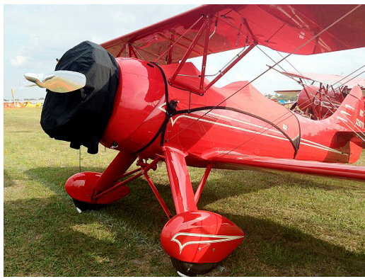
Waco UPF-7 Canopy & Engine Cover