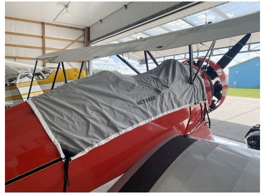
Waco QCF-2 Travel Weight Canopy Cover