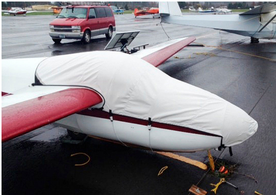
SGS 1-26B Canopy/Nose Cover

Covers developed this material combination especially for aircraft protection. The outer material is medium weight and treated for water resistance, UV resistance and anti-static buildup. The inner lining is a very soft and smooth microfiber to prevent scratching. The material is very reflective, and tests show that the cabin interior temperature can be reduced to near-ambient temperature on the hottest of days. It is water, ice and snow repellent, yet breathable to allow moisture to escape from between the cover and the aircraft surface.