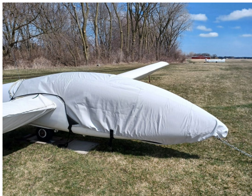
Wsk Pzl-Krosno KR-03A Canopy/Nose Cover

Covers developed this material combination especially for aircraft protection. The outer material is medium weight and treated for water resistance, UV resistance and anti-static buildup. The inner lining is a very soft and smooth microfiber to prevent scratching. The material is very reflective, and tests show that the cabin interior temperature can be reduced to near-ambient temperature on the hottest of days. It is water, ice and snow repellent, yet breathable to allow moisture to escape from between the cover and the aircraft surface.