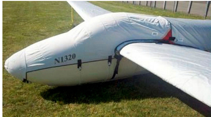
Schweizer SGS 1-26B Canopy/Nose, Wings & Empennage Covers