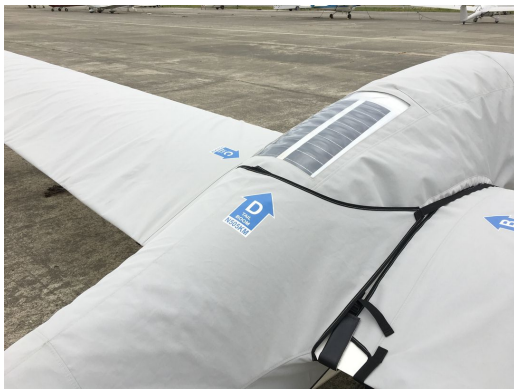
DG-505 Full Cover Set

WINTER USE MATERIAL - Made with Solution-Dyed Polyester fabric, this option is intended for seasonal use to aid in deicing, rain mitigation, or for occasional travel. The material is lighter and more compact, but more susceptible to UV damage and may have a shorter useful life if used continuously outside than the all-year use material.