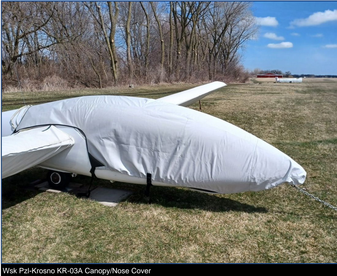
Wsk Pzl-Krosno KR-03A Canopy/Nose Cover