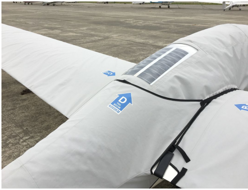
DG-505 Full Cover Set