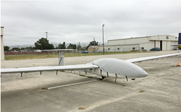
DG-505 Canopy/Nose, Wing, Empennage & Horiz. Stab. Covers

WINTER USE MATERIAL - Made with Solution-Dyed Polyester fabric, this option is intended for seasonal use to aid in deicing, rain mitigation, or for occasional travel. The material is lighter and more compact, but more susceptible to UV damage and may have a shorter useful life if used continuously outside than the all-year use material.