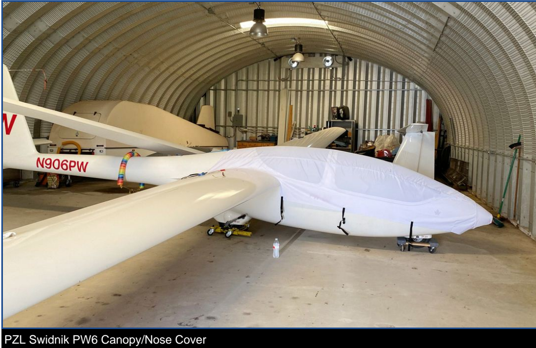
PZL Swidnik PW6 Canopy/Nose Cover