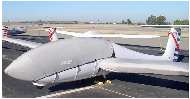
Grob 103 Canopy/Nose Cover and Wing Covers