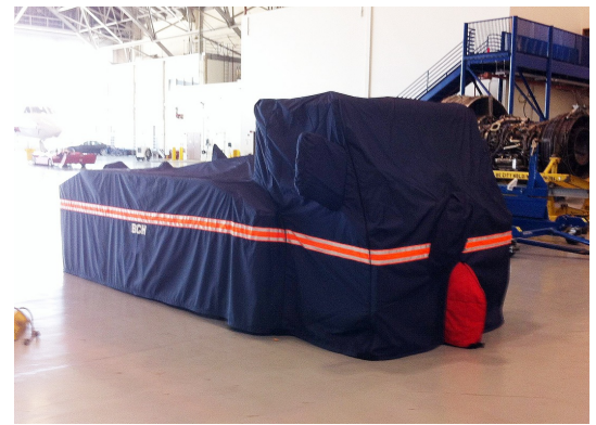
PW 2000 Series OFF-LINK ENGINE STORAGE COVER, Rain Cap