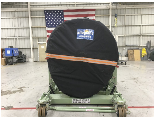
CFM56-5B Off Link Cover, fully enclosed