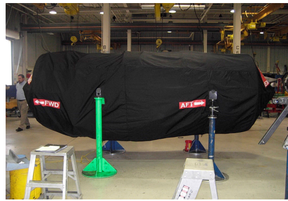
PW JT8D Off-Link Engine Transport Cover (no nose cone, no TR's), fully enclosed