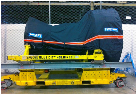
PW JT9D Series Off-Link Engine Transport Cover, Fully Enclosed, P/N: PW-120