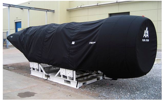
PW JT8D Off-Link Protective Long-term Storage "Rain Cap" Style Engine Cover