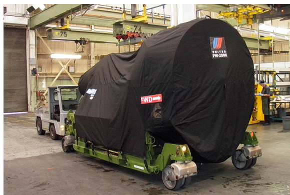
PW 2000 Series OFF-LINK ENGINE STORAGE COVER, Rain Cap