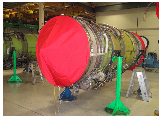
PW JT8D Off-Link Engine Shower Cap Cover Set