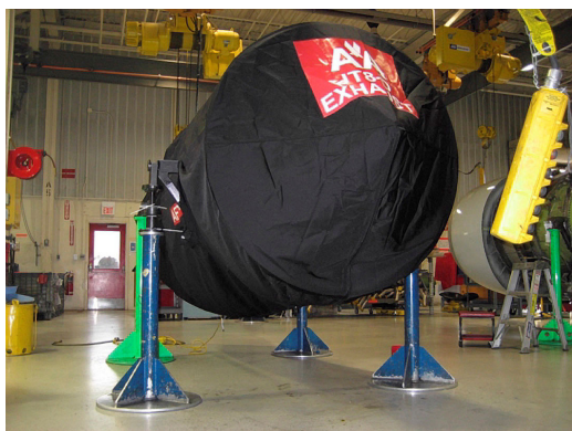
PW JT8D Off-Link Engine Transport Cover (no nose cone, no TR's), fully enclosed