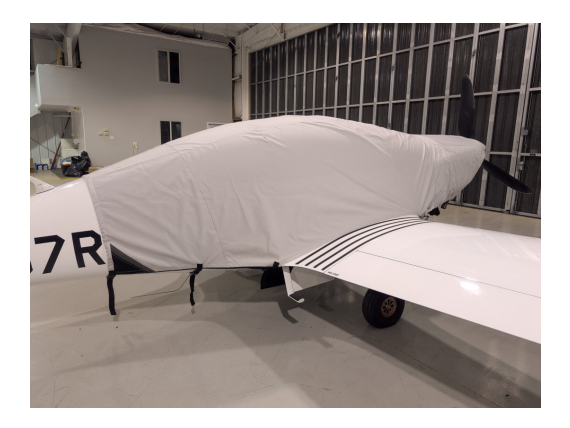
Pipistrel Panthera Extended Canopy/Engine Cover