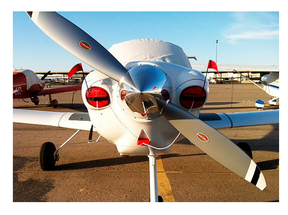
Diamond DA-40 Engine Inlet Plugs (set of 3)