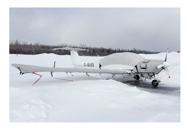
Diamond DA40 Canopy, Insulated Engine, Wing and Stab. Covers