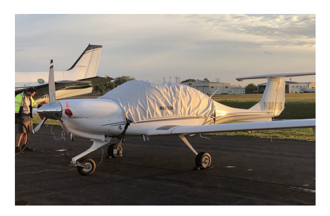
Diamond DA-40 Canopy Cover & Engine Plugs

Engine Inlet Plugs are custom fit for your Pipistrel Panthera intakes, made with heavy-duty vinyl material, and stuffed with a single block of sculpted urethane foam. Each plug has a zipper that allows the foam to be removed and dried if necessary. Engine plugs have warning flags that are visible from the cockpit or 'remove before flight' streamers sewn onto the face of the plugs. Most plugs are imprinted with the aircraft registration number in black for an extra charge. Storage bag NOT included. Engine plugs may be inserted after flight when the engine is still warm. Engine Inlet Plugs are commonly referred to as Cowl Plugs, Intake Plugs, Cowl Blocks, Engine Blocks, and Engine Bungs.