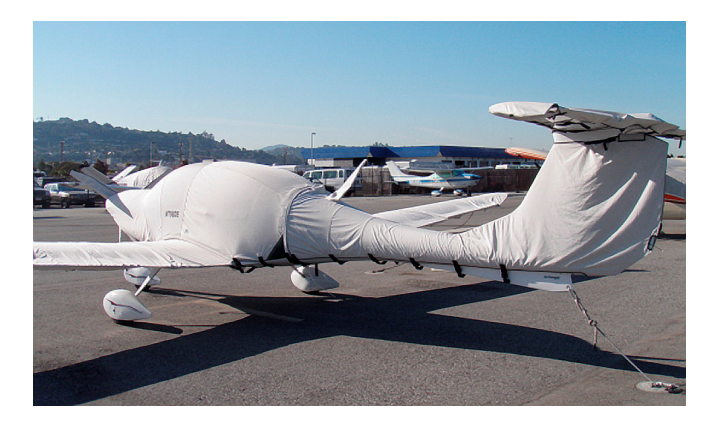
Diamond DA-40 Extended Canopy Cover, Wing Covers & Insulated Engine Cover