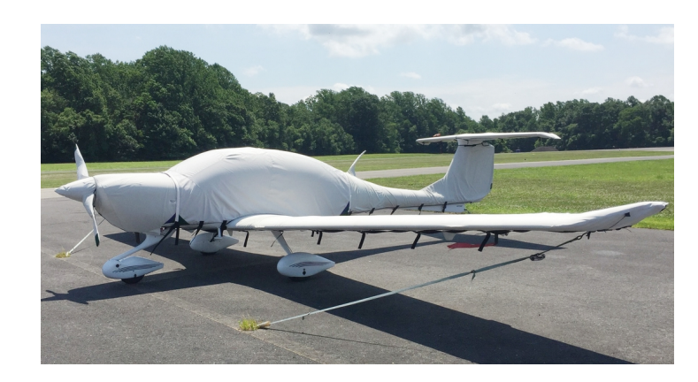
Diamond DA-40 Extended Canopy, Wing, Engine, Prop, Empennage & Horiz. Stab Covers