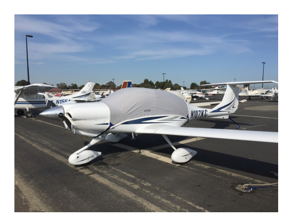
Diamond DA-40 Travel Cover, Light Weight Travel Canopy Cover

Travel Covers are made with Silver Solution-Dyed Polyester fabric and only lined over the windshield to save weight. The material is lightweight and more compact for easy stowage in the aircraft. The polyester material is water resistant, but only intended for occasional use outside. We also have an ultra lightweight material available for fitted hangar dust covers. For daily outdoor use, the non-travel Sunbrella Cover is the best choice.