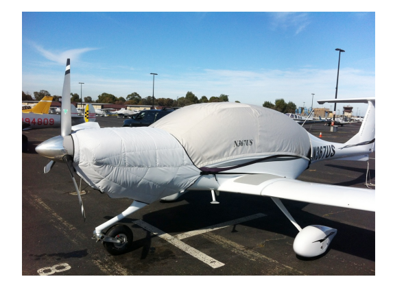
Diamond DA-40 Insulated Engine Cover, Silver/Grey

This cover type is made from Silver Acrylic Sunbrella canvas and is 100% lined with a soft and smooth microfiber. Bruce's Custom Covers developed this material combination especially for aircraft protection. The outer material is medium weight and treated for water resistance, UV resistance and anti-static buildup. The inner lining is a very soft and smooth microfiber to prevent scratching. The material is very reflective, and tests show that the cabin interior temperature can be reduced to near-ambient temperature on the hottest of days. It is water, ice and snow repellent, yet breathable to allow moisture to escape from between the cover and the aircraft surface.