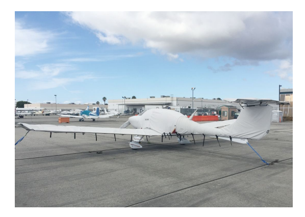
Diamond DA-40 Full Cover Set

This cover type is made from Silver Acrylic Sunbrella canvas and is 100% lined with a soft and smooth microfiber. Bruce's Custom Covers developed this material combination especially for aircraft protection. The outer material is medium weight and treated for water resistance, UV resistance and anti-static buildup. The inner lining is a very soft and smooth microfiber to prevent scratching. The material is very reflective, and tests show that the cabin interior temperature can be reduced to near-ambient temperature on the hottest of days. It is water, ice and snow repellent, yet breathable to allow moisture to escape from between the cover and the aircraft surface.