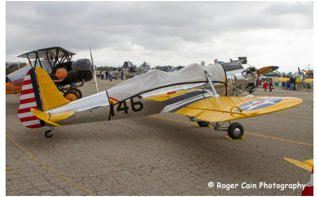
Ryan PT-22 Canopy Cover