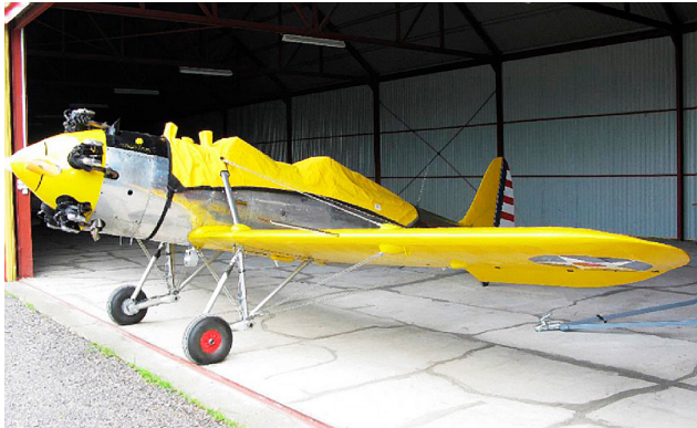
Ryan PT22 Canopy Cover