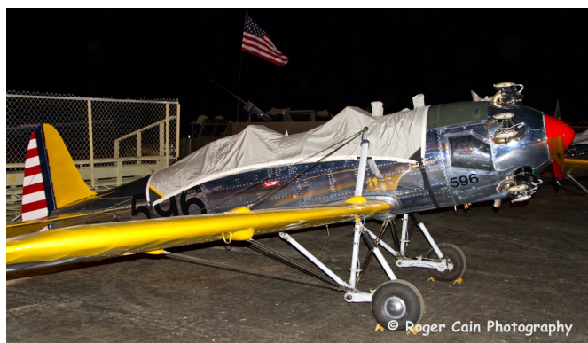
Ryan PT-22 Canopy Cover

Travel Covers are made with Silver Solution-Dyed Polyester fabric and only lined over the windshield to save weight. The material is lightweight and more compact for easy stowage in the aircraft. The polyester material is water resistant, but only intended for occasional use outside. We also have an ultra lightweight material available for fitted hangar dust covers. For daily outdoor use, the non-travel Sunbrella Cover is the best choice.