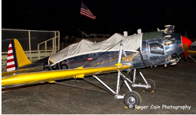
Ryan PT-22 Canopy Cover

This cover type is made from Silver Acrylic Sunbrella canvas and is 100% lined with a soft and smooth microfiber. Bruce's Custom Covers developed this material combination especially for aircraft protection. The outer material is medium weight and treated for water resistance, UV resistance and anti-static buildup. The inner lining is a very soft and smooth microfiber to prevent scratching. The material is very reflective, and tests show that the cabin interior temperature can be reduced to near-ambient temperature on the hottest of days. It is water, ice and snow repellent, yet breathable to allow moisture to escape from between the cover and the aircraft surface.