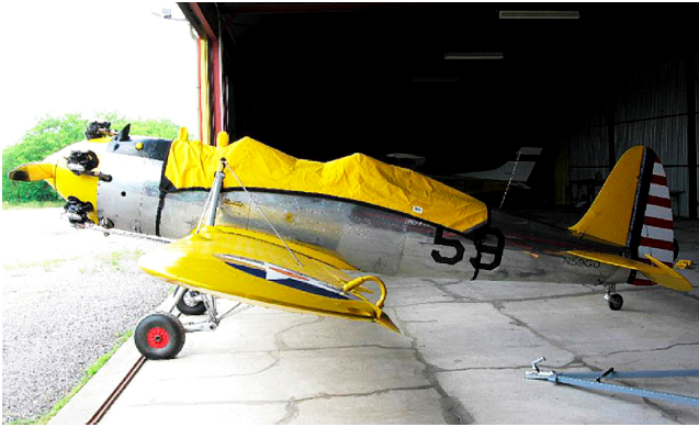
Ryan PT-22 Canopy Cover

This cover type is made from Silver Acrylic Sunbrella canvas and is 100% lined with a soft and smooth microfiber. Bruce's Custom Covers developed this material combination especially for aircraft protection. The outer material is medium weight and treated for water resistance, UV resistance and anti-static buildup. The inner lining is a very soft and smooth microfiber to prevent scratching. The material is very reflective, and tests show that the cabin interior temperature can be reduced to near-ambient temperature on the hottest of days. It is water, ice and snow repellent, yet breathable to allow moisture to escape from between the cover and the aircraft surface.