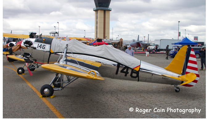
Ryan PT-22 Canopy Cover