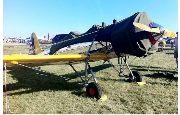
Ryan PT-22 Canopy Cover and Engine Cover