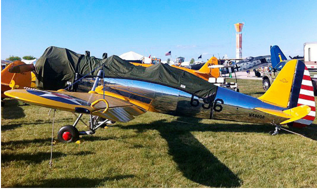
Ryan PT-22 ST3KR Canopy Cover and Engine Cover

water resistance, UV resistance and anti-static buildup. The inner lining is a very soft and smooth microfiber to prevent scratching. The material is very reflective, and tests show that the cabin interior temperature can be reduced to near-ambient temperature on the hottest of days. It is water, ice and snow repellent, yet breathable to allow moisture to escape from between the cover and the aircraft surface.