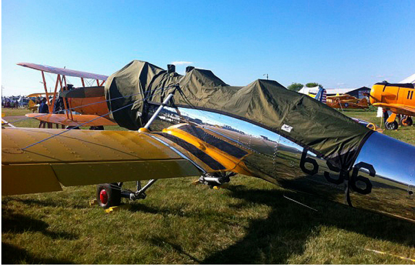
Ryan PT-22 Canopy Cover and Engine Cover

This cover type is made from Silver Acrylic Sunbrella canvas and is 100% lined with a soft and smooth microfiber. Bruce's Custom Covers developed this material combination especially for aircraft protection. The outer material is medium weight and treated for water resistance, UV resistance and anti-static buildup. The inner lining is a very soft and smooth microfiber to prevent scratching. The material is very reflective, and tests show that the cabin interior temperature can be reduced to near-ambient temperature on the hottest of days. It is water, ice and snow repellent, yet breathable to allow moisture to escape from between the cover and the aircraft surface.