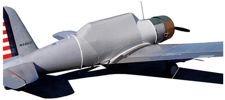
BT-13 Extended Canopy Cover