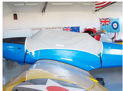
Fairchild PT-26 Canopy Cover