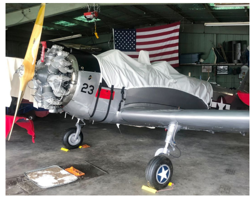
Fairchild PT-23 Canopy Cover