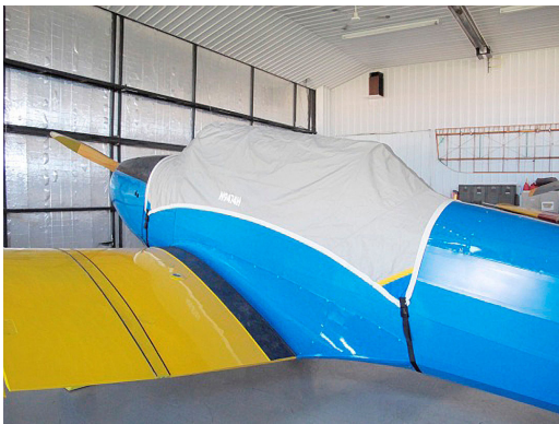
Fairchild PT-26 Canopy Cover

Travel Covers are made with Silver Solution-Dyed Polyester fabric and only lined over the windshield to save weight. The material is lightweight and more compact for easy stowage in the aircraft. The polyester material is water resistant, but only intended for occasional use outside. We also have an ultra lightweight material available for fitted hangar dust covers. For daily outdoor use, the non-travel Sunbrella Cover is the best choice.