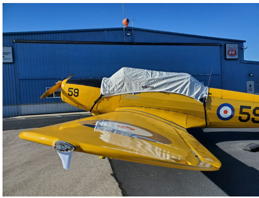
Fairchild PT-19 Canopy Cover