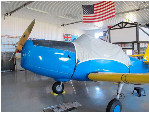
Fairchild PT-26 Canopy Cover