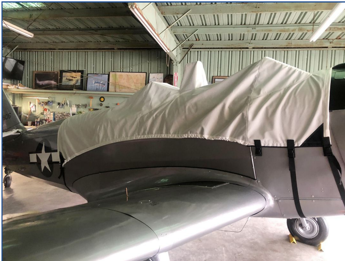
Fairchild PT-23 Canopy Cover