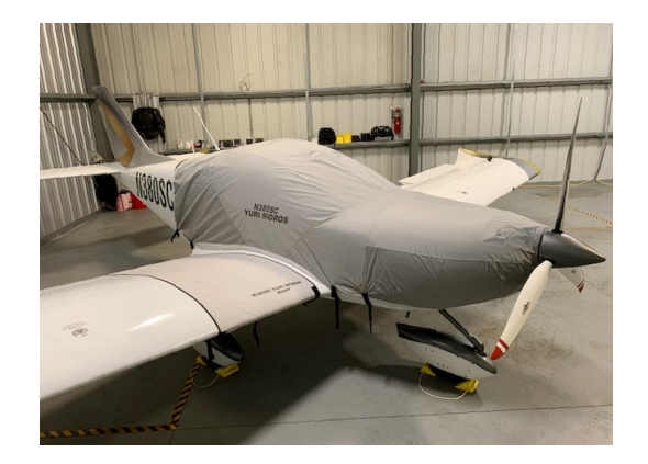
Czech Sport Travel Light Weight Canopy/Engine Cover, Wing Locker Covers

WINTER USE MATERIAL - Made with Solution-Dyed Polyester fabric, this option is intended for seasonal use to aid in deicing, rain mitigation, or for occasional travel. The material is lighter and more compact, but more susceptible to UV damage and may have a shorter useful life if used continuously outside than the all-year use material.