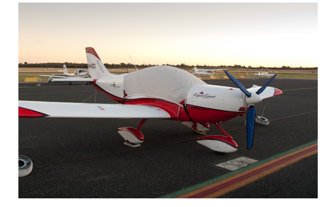
PiperSport Canopy Cover, Engine Plugs

Travel Covers are made with Silver Solution-Dyed Polyester fabric and only lined over the windshield to save weight. The material is lightweight and more compact for easy stowage in the aircraft. The polyester material is water resistant, but only intended for occasional use outside. We also have an ultra lightweight material available for fitted hangar dust covers. For daily outdoor use, the non-travel Sunbrella Cover is the best choice.