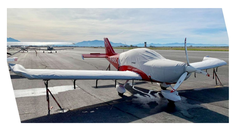
Czech Sport Canopy/Engine & Wing Covers