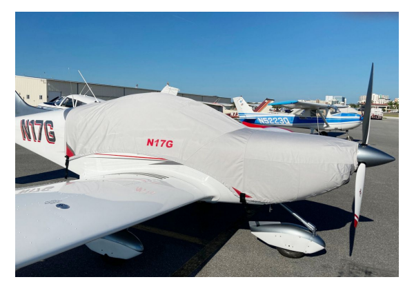
Czech Sportcruiser Canopy/Engine Cover

This cover type is made from Silver Acrylic Sunbrella canvas and is 100% lined with a soft and smooth microfiber. Bruce's Custom Covers developed this material combination especially for aircraft protection. The outer material is medium weight and treated for water resistance, UV resistance and anti-static buildup. The inner lining is a very soft and smooth microfiber to prevent scratching. The material is very reflective, and tests show that the cabin interior temperature can be reduced to near-ambient temperature on the hottest of days. It is water, ice and snow repellent, yet breathable to allow moisture to escape from between the cover and the aircraft surface.