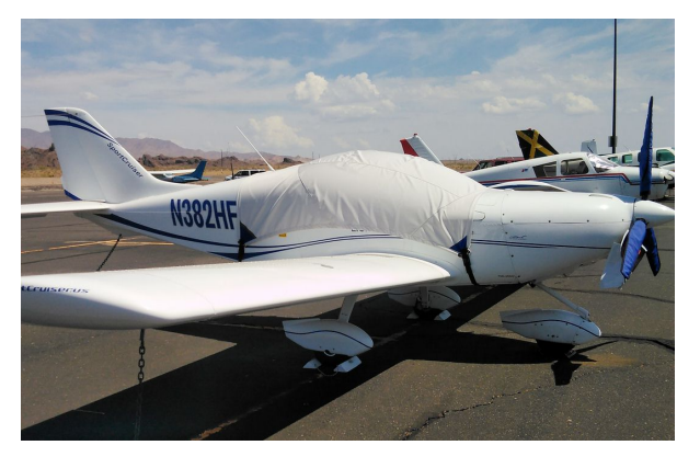
Czech Aircraft Works Sport Cruiser