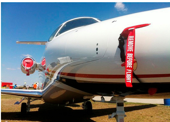
Premier Heat Resistant Pitot Covers set & Engine Intake Plugs

The Hawker Beechcraft Premier 390 Intake/Exhaust Plugs are custom fit for the intake and exhaust openings, made with heavy-duty vinyl material, and stuffed with a single block of sculpted urethane foam. Each plug has a zipper that allows the foam to be removed and dried if necessary. Engine plugs have 'remove before flight' streamers sewn onto the face of the plugs. Most plugs are imprinted with the aircraft registration number in black. Engine plugs may be inserted after flight when the engine is still warm. Engine Inlet Plugs are commonly referred to as Cowl Plugs, Intake Plugs, Cowl Blocks, Engine Blocks, and Engine Bungs.