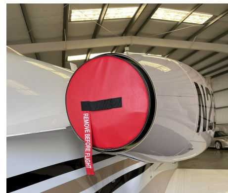
Hawker Beechcraft Premier 390 Intake Plug/Exhaust Plug Set