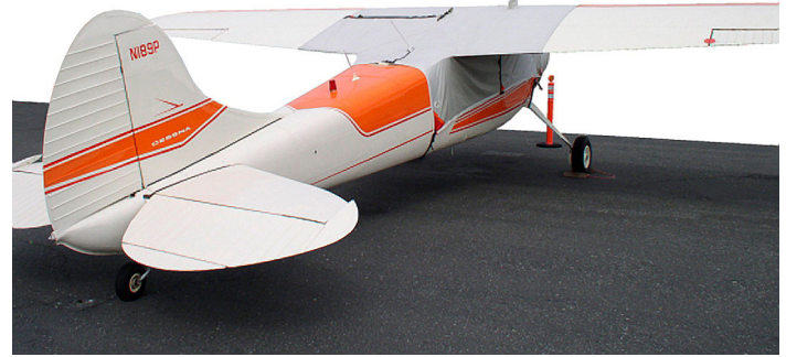
Cessna 195 Over-Top Canopy, Engine & Prop Covers