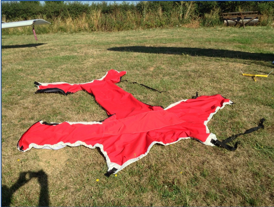
Porterfield Collegiate Canopy Cover