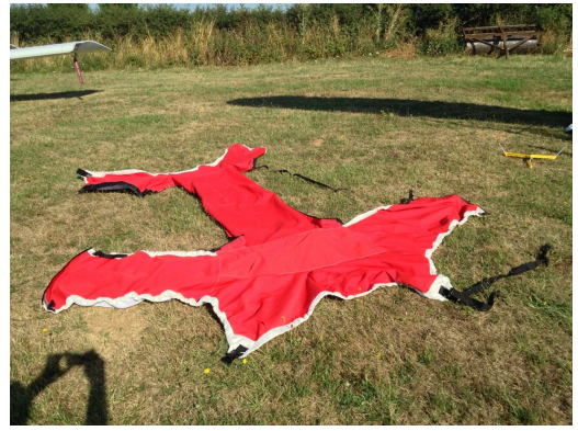
Porterfield Collegiate Canopy Cover