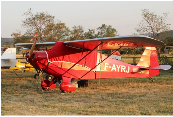
Porterfield Collegiate Canopy Cover