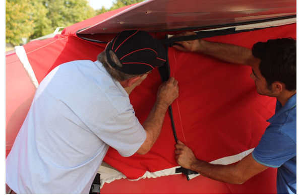
Porterfield Collegiate Canopy Cover