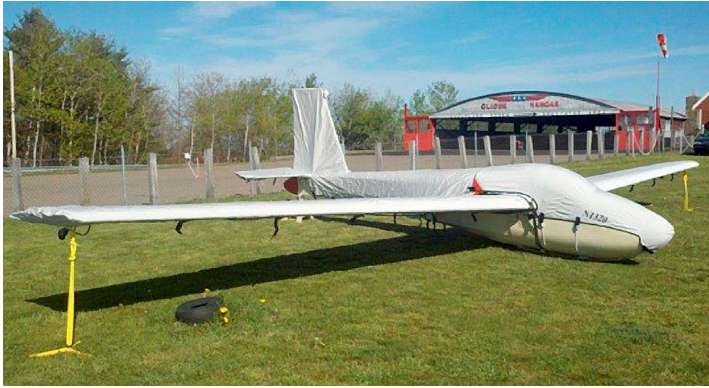
Schweizer 1-26B Canopy/Nose, Empennage & Wing Covers