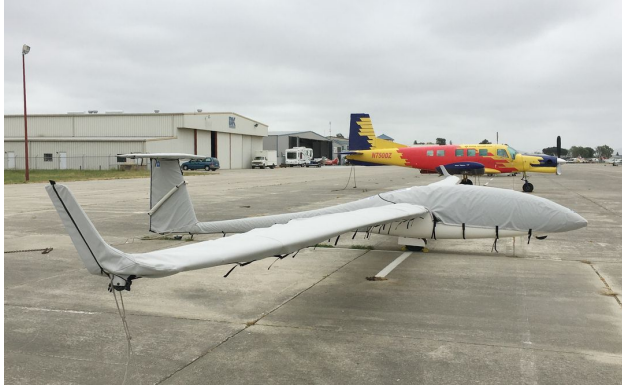
DG-505 Canopy/Nose, Wing, Empennage & Horiz. Stab. Covers

WINTER USE MATERIAL - Made with Solution-Dyed Polyester fabric, this option is intended for seasonal use to aid in deicing, rain mitigation, or for occasional travel. The material is lighter and more compact, but more susceptible to UV damage and may have a shorter useful life if used continuously outside than the all-year use material.