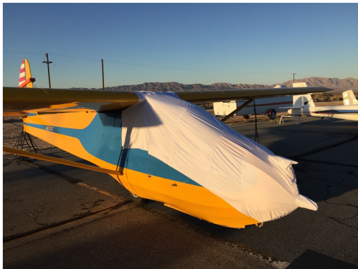
Schweizer SGU 2-22EK Canopy/Nose Cover, test fit cover

the hottest of days. It is water, ice and snow repellent, yet breathable to allow moisture to escape from between the cover and the aircraft surface.