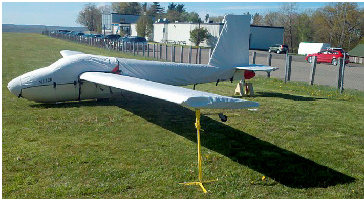
SGS 1-26B Canopy/Nose, Empennage & Wing Covers