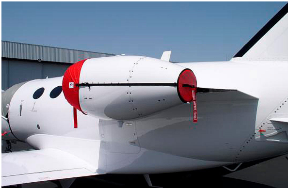
Cessna Mustang Intake/Exhaust Plug Set