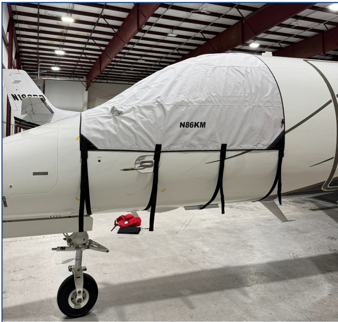
Phenom 300 Cockpit Cover