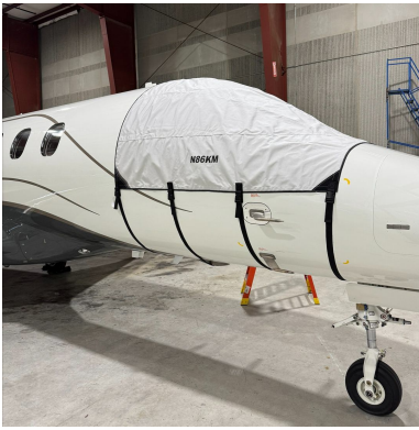
Phenom 300 Cockpit Cover