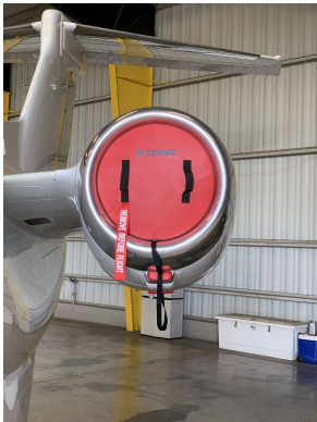
Embraer Phenom 300 Intake Plugs