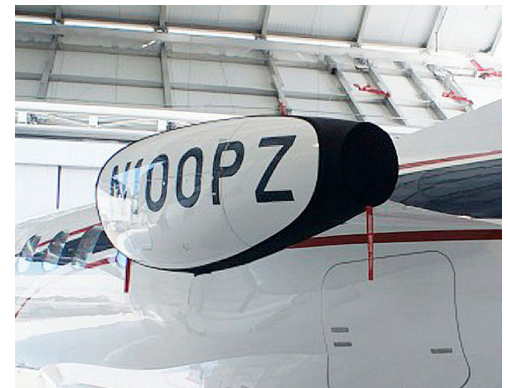
Phenom 100 "Bikini" Engine Covers