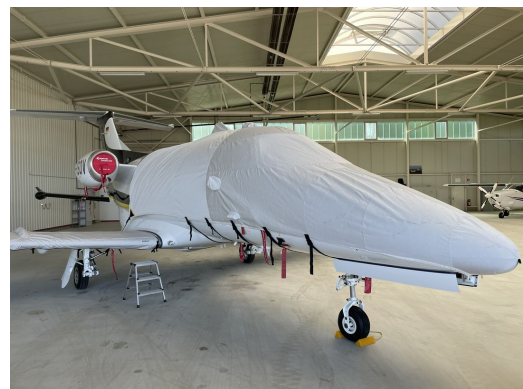
Embraer Phenom 100 Canopy/Nose Cover