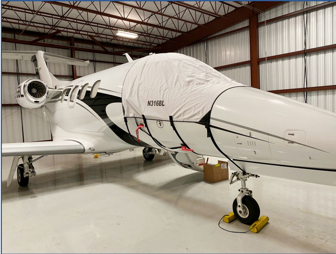
Embraer Phenom 100 Cockpit Cover