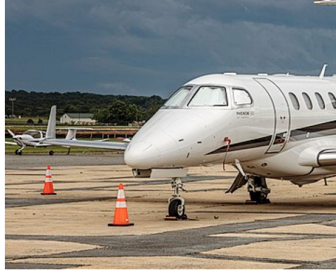
Embraer Phenom 100 Cockpit HeatShields

out because some aircraft manufacturers have issued advisories against reflective window inserts due to potential heat damage. A Heatshield is an excellent short-term remedy for cockpit overheating, but an external fabric cover is more effective for long-term protection.