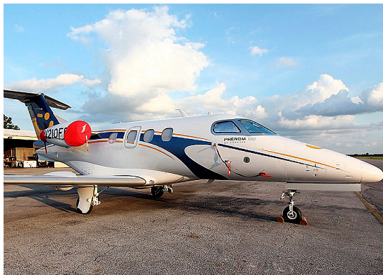
Embraer Phenom 100 Engine Covers set, Heat Resistant Pitot and AOA Covers & Interior Cockpit HeatShields set

The Embraer Phenom 100 (EMB-500) Intake/Exhaust Plugs are custom fit for the intake and exhaust openings, made with heavy-duty vinyl material, and stuffed with a single block of sculpted urethane foam. Each plug has a zipper that allows the foam to be removed and dried if necessary. Engine plugs have 'remove before flight' streamers sewn onto the face of the plugs. Most plugs are imprinted with the aircraft registration number in black. Engine plugs may be inserted after flight when the engine is still warm. Engine Inlet Plugs are commonly referred to as Cowl Plugs, Intake Plugs, Cowl Blocks, Engine Blocks, and Engine Bungs.