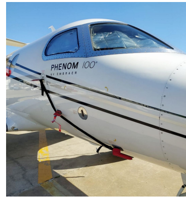
Phenom 100 (EMB 500) Pitot Cover/AOA Set