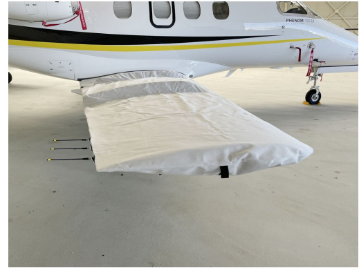
Embraer Phenom 100 Canopy/Nose Cover