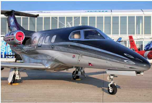
Phenom 100 Engine Inlet Plugs

The Engine Inlet Plugs are custom fit for your Embraer Phenom 100 (EMB-500) intakes, made with heavy-duty vinyl material, and stuffed with a single block of sculpted urethane foam. Each plug has a zipper that allows the foam to be removed and dried if necessary. Engine plugs have 'remove before flight' streamers sewn onto the face of the plugs. Most plugs are imprinted with the aircraft registration number in black for an extra charge. Storage bag NOT included. Engine plugs may be inserted after flight when the engine is still warm. Engine Inlet Plugs are commonly referred to as Cowl Plugs, Intake Plugs, Cowl Blocks, Engine Blocks, and Engine Bungs.