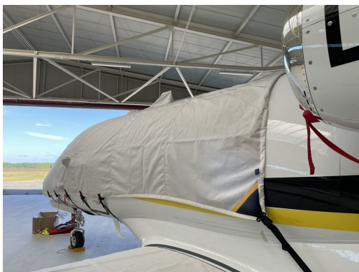
Embraer Phenom 100 Canopy/Nose Cover

This cover type is made from Silver Acrylic Sunbrella canvas and is 100% lined with a soft and smooth microfiber. Bruce's Custom Covers developed this material combination especially for aircraft protection. The outer material is medium weight and treated for water resistance, UV resistance and anti-static buildup. The inner lining is a very soft and smooth microfiber to prevent scratching. The material is very reflective, and tests show that the cabin interior temperature can be reduced to near-ambient temperature on the hottest of days. It is water, ice and snow repellent, yet breathable to allow moisture to escape from between the cover and the aircraft surface.