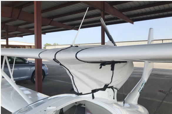
Scoda Aeronautica Super Petrel Engine Cover