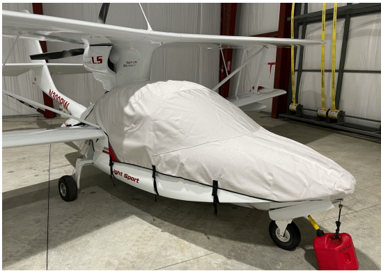
Scoda Super Petrel Canopy/Nose Cover