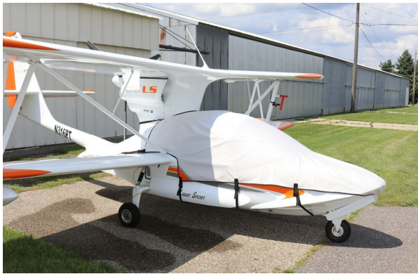
Scoda Aeronautica Super Petrel Canopy/Nose Cover

lightweight and more compact for easy stowage in the aircraft. The polyester material is water resistant, but only intended for occasional use outside. We also have an ultra lightweight material available for fitted hangar dust covers. For daily outdoor use, the non-travel Sunbrella Cover is the best choice.