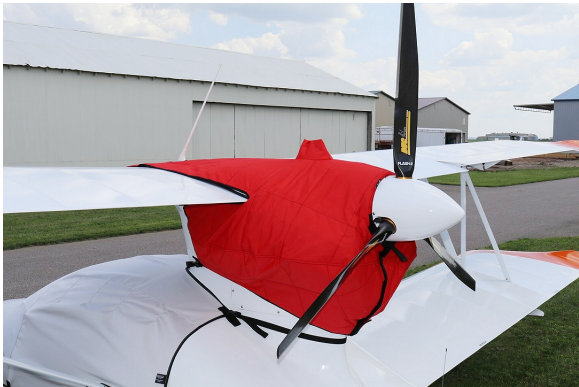
Scoda Aeronautica Super Petrel Insulated Engine Cover

Insulated Covers Material - A special composite material of solution-dyed polyester, 3M Thinsulate insulation, and soft nylon interior fabric. Our insulated covers are designed to complement an engine preheater and help retain heat in the engine compartment after shutdown. If you operate your aircraft in cold-weather, these covers will help prevent engine wear and tear.