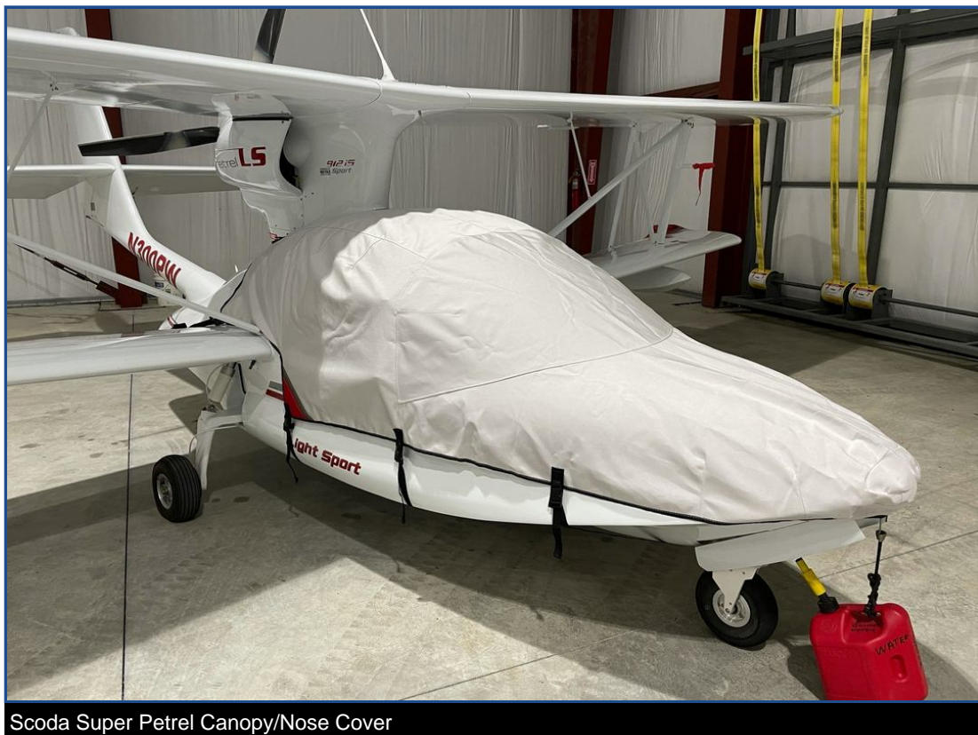
Scoda Super Petrel Canopy/Nose Cover