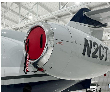
Pilatus PC-24 Engine Inlet Plugs

The Engine Inlet Plugs are custom fit for your Pilatus PC-24 intakes, made with heavy-duty vinyl material, and stuffed with a single block of sculpted urethane foam. Each plug has a zipper that allows the foam to be removed and dried if necessary. Engine plugs have 'remove before flight' streamers sewn onto the face of the plugs. Most plugs are imprinted with the aircraft registration number in black for an extra charge. Storage bag NOT included. Engine plugs may be inserted after flight when the engine is still warm. Engine Inlet Plugs are commonly referred to as Cowl Plugs, Intake Plugs, Cowl Blocks, Engine Blocks, and Engine Bungs.