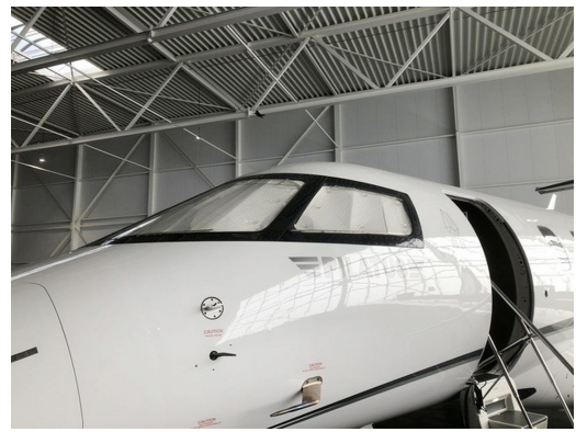
Pilatus PC-24 Cockpit HeatShields