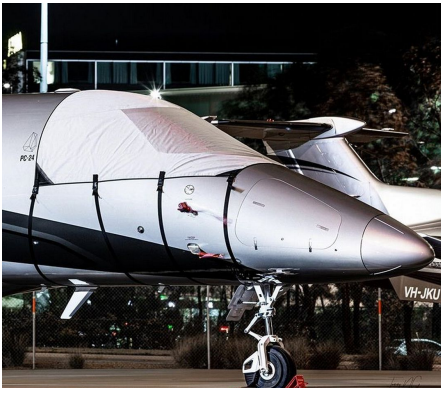
Pilatus PC-24 Cockpit Cover