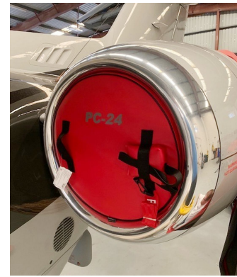
Pilatus PC-24 Engine Intake Plug