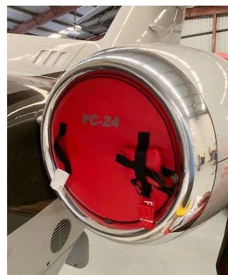
Pilatus PC-24 Engine Intake Plug