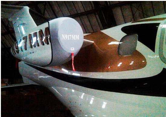
Phenom 100 Intake/Exhaust Cover, "Bikini" Type

The Pilatus PC-24 Intake/Exhaust Plugs are custom fit for the intake and exhaust openings, made with heavy-duty vinyl material, and stuffed with a single block of sculpted urethane foam. Each plug has a zipper that allows the foam to be removed and dried if necessary. Engine plugs have 'remove before flight' streamers sewn onto the face of the plugs. Most plugs are imprinted with the aircraft registration number in black. Engine plugs may be inserted after flight when the engine is still warm. Engine Inlet Plugs are commonly referred to as Cowl Plugs, Intake Plugs, Cowl Blocks, Engine Blocks, and Engine Bungs.