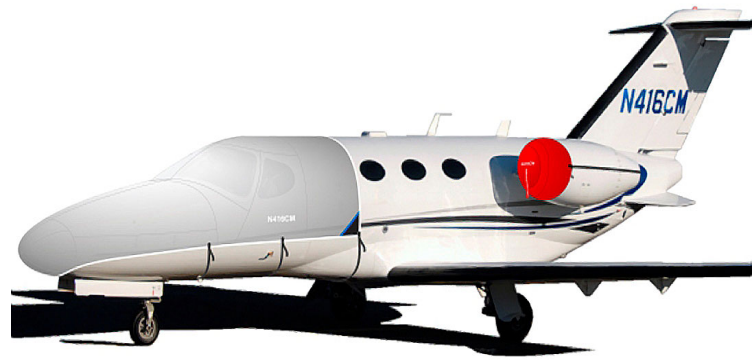
Citation Mustang Cockpit/Door/Nose Cover, Engine Inlet Cover