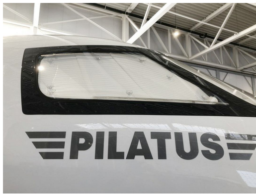
Pilatus PC-24 Cockpit HeatShields