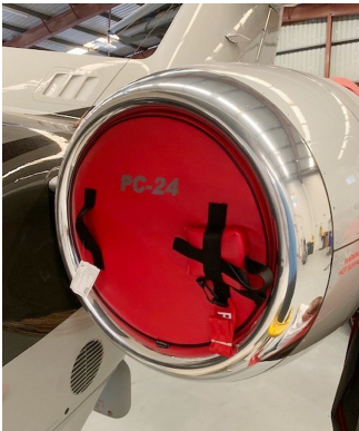
Pilatus PC-24 Engine Intake Plug