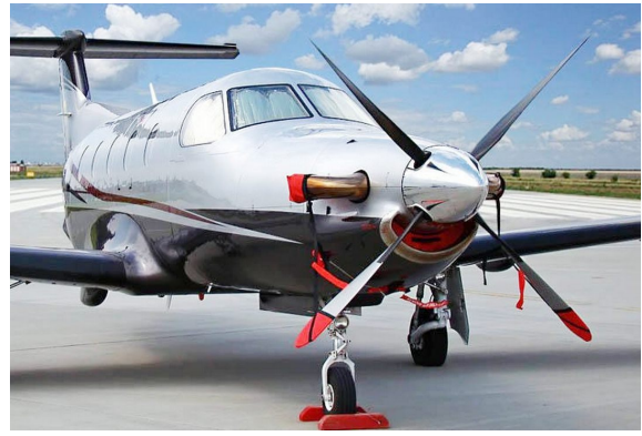
Pilatus PC-12 Engine Plugs, Prop Ties, Cockpit HeatShields