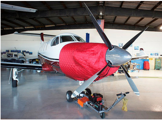
Pilatus PC-12 Insulated Engine Cover