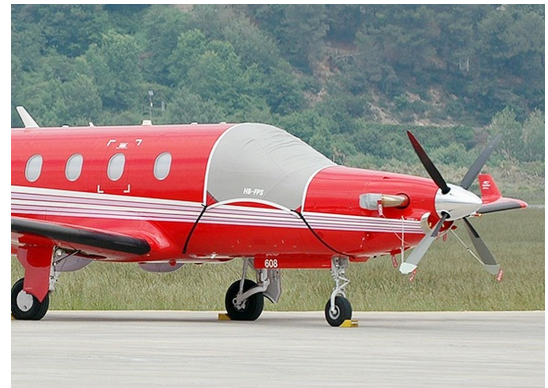
Pilatus PC-12 Windshield Cover