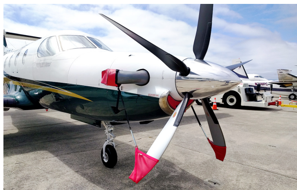
Main Intake Plug and Prop-Tie/Exhaust Covers. (Sold Separately)