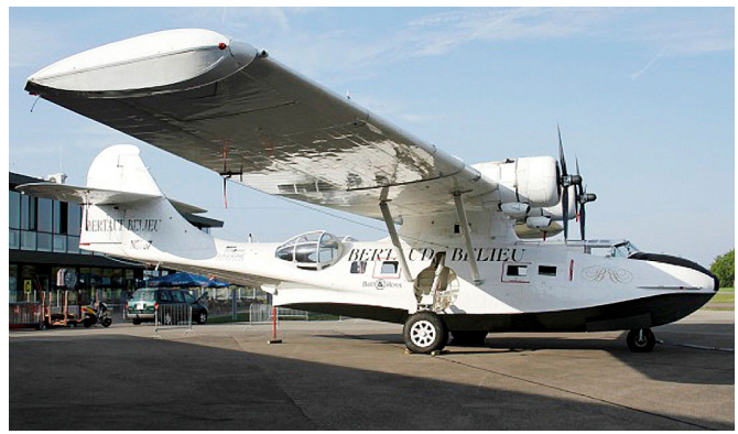
Covers, Plugs, and related items for the PBX