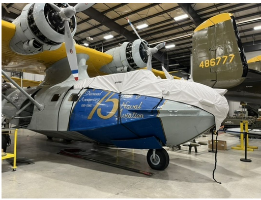
Consolidated Vultee PBX Cockpit/Nose Cover