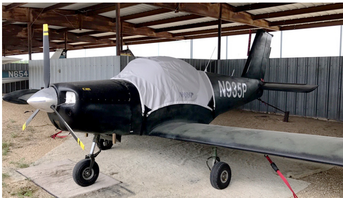
Pazmany PL2 Homebuilt Canopy Cover

This cover type is made from Silver Acrylic Sunbrella canvas and is 100% lined with a soft and smooth microfiber. Bruce's Custom Covers developed this material combination especially for aircraft protection. The outer material is medium weight and treated for water resistance, UV resistance and anti-static buildup. The inner lining is a very soft and smooth microfiber to prevent scratching. The material is very reflective, and tests show that the cabin interior temperature can be reduced to near-ambient temperature on the hottest of days. It is water, ice and snow repellent, yet breathable to allow moisture to escape from between the cover and the aircraft surface.