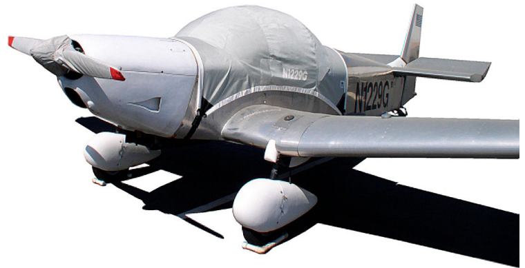
Zenith CH601 Canopy Cover & Prop Cover