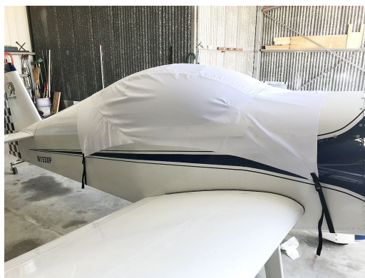
SPA, Sport Performance Aviation, Panther Canopy Cover (test fit cover)