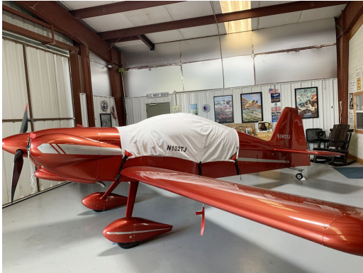
SPA Sport Panther Canopy Cover

This cover type is made from Silver Acrylic Sunbrella canvas and is 100% lined with a soft and smooth microfiber. Bruce's Custom Covers developed this material combination especially for aircraft protection. The outer material is medium weight and treated for water resistance, UV resistance and anti-static buildup. The inner lining is a very soft and smooth microfiber to prevent scratching. The material is very reflective, and tests show that the cabin interior temperature can be reduced to near-ambient temperature on the hottest of days. It is water, ice and snow repellent, yet breathable to allow moisture to escape from between the cover and the aircraft surface.