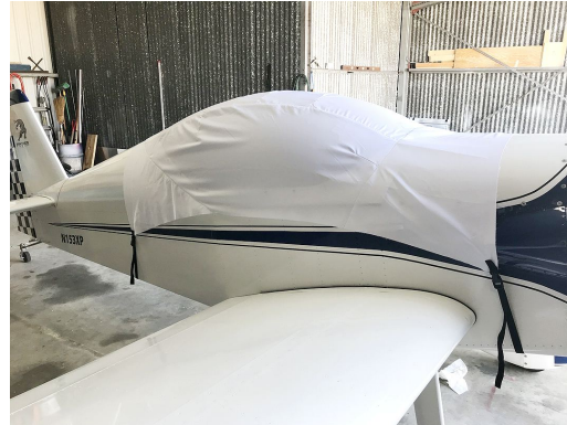
SPA, Sport Performance Aviation, Panther Canopy Cover (test fit cover)