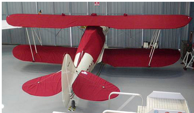
Waco UPF-7 Upper/Lower Wing Cover, Horizontal Stabilizer Cover, & Canopy Cover