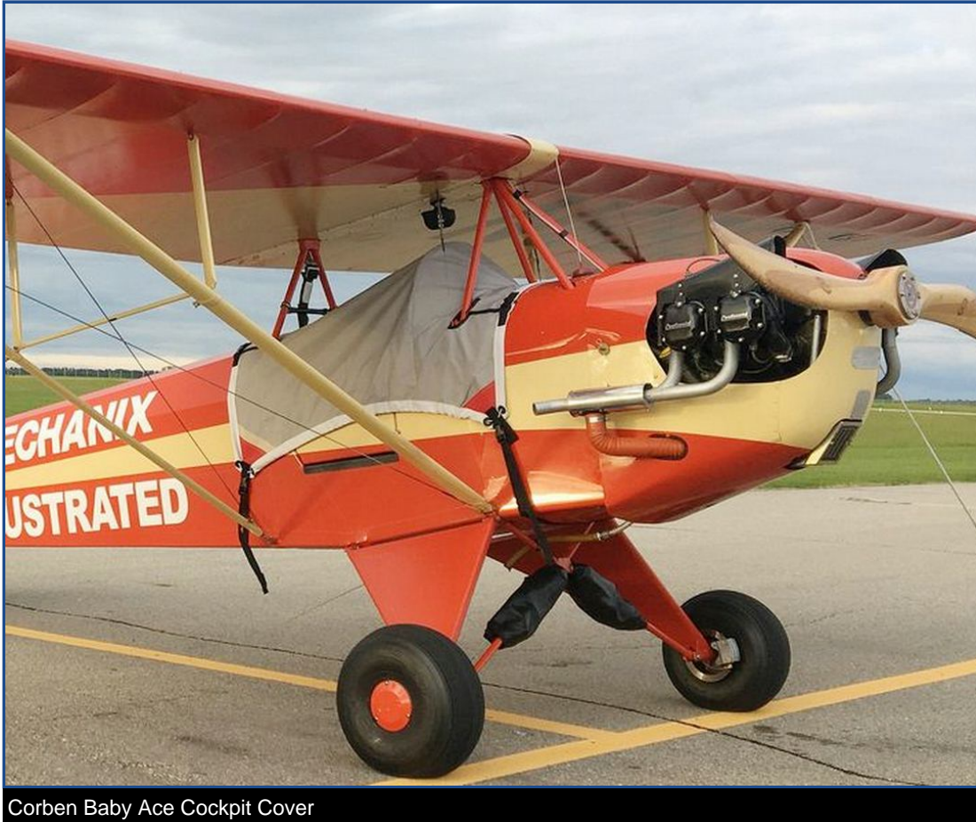
Corben Baby Ace Cockpit Cover