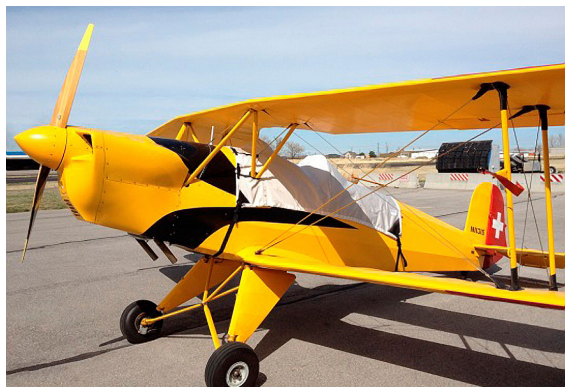
Bucker Jungmann Canopy Cover

This cover type is made from Silver Acrylic Sunbrella canvas and is 100% lined with a soft and smooth microfiber. Bruce's Custom Covers developed this material combination especially for aircraft protection. The outer material is medium weight and treated for water resistance, UV resistance and anti-static buildup. The inner lining is a very soft and smooth microfiber to prevent scratching. The material is very reflective, and tests show that the cabin interior temperature can be reduced to near-ambient temperature on the hottest of days. It is water, ice and snow repellent, yet breathable to allow moisture to escape from between the cover and the aircraft surface.