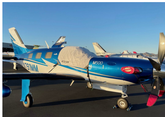
Piper M500 Cockpit Cover