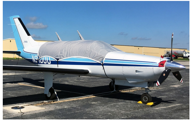
Piper PA-46 Malibu Travel Cover