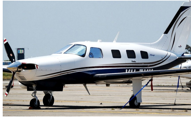
Piper PA-46-350P Mirage, Matrix, JetProp Cockpit Heatshields