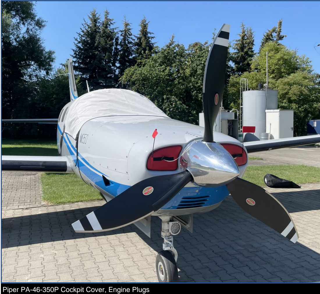
Piper PA-46-350P Cockpit Cover, Engine Plugs