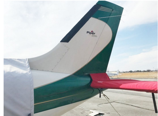
Piper Malibu/Mirage Horizontal Stabilizer/Tailcone Cover