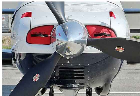
Piper PA-46-350P Mirage Engine Inlet Plugs