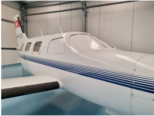
Piper PA-46 Malibu Cockpit Heatshields

Heatshields are interior sunshades for an aircraft's windows or canopy glass. The product is a unique composite of closed-cell foam with a silver mylar finish. The semi-rigid design is stiff enough to stand along the inside of the windshield using sun visors or window framing. It folds up flat and easily stores in the included storage sleeve. Some designs may require velcro and suction cups. A Heatshield is an excellent short-term remedy for cockpit overheating.