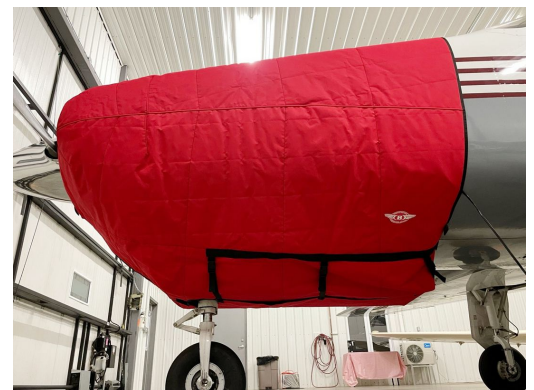
Malibu PA-46-310P Insulated Engine Cover