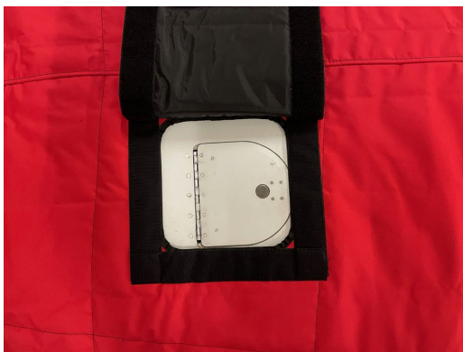
Malibu PA-46-310P Insulated Engine Cover, Oil Door Access

This cover type is made from Silver Acrylic Sunbrella canvas and is 100% lined with a soft and smooth microfiber. Bruce's Custom Covers developed this material combination especially for aircraft protection. The outer material is medium weight and treated for water resistance, UV resistance and anti-static buildup. The inner lining is a very soft and smooth microfiber to prevent scratching. The material is very reflective, and tests show that the cabin interior temperature can be reduced to near-ambient temperature on the hottest of days. It is water, ice and snow repellent, yet breathable to allow moisture to escape from between the cover and the aircraft surface.