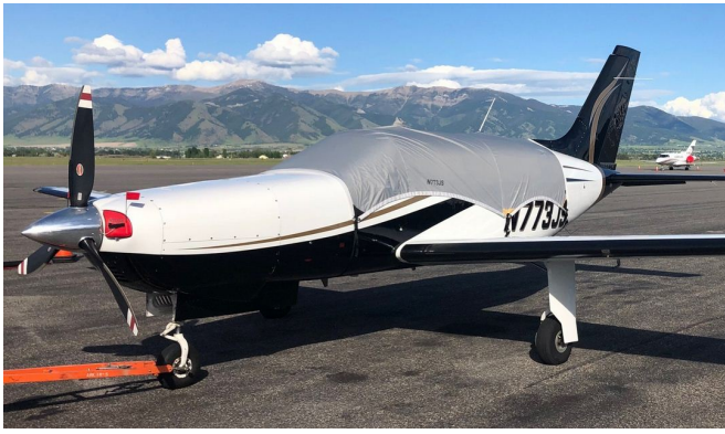
Piper PA46-350P Travel Canopy Cover, Engine Plugs