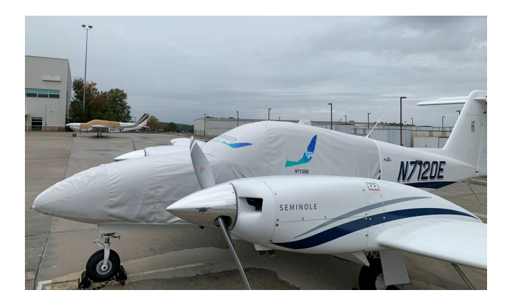
Piper PA-44 Seminole Canopy/Nose Cover with custom artwork