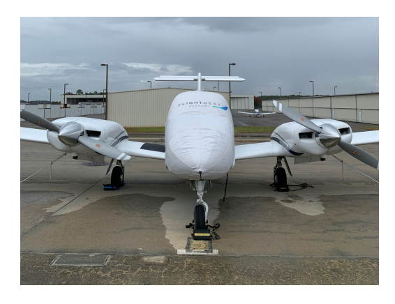
Piper PA-44 Seminole Canopy/Nose Cover