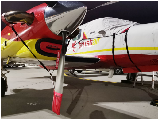
Piper PA-42 Cheyenne III Cockpit Cover, Prop Tie/Exhaust Cover, Inlet Plugs

Engine Inlet Plugs are custom fit for your Piper PA-42 Cheyenne III intakes, made with heavy-duty vinyl material, and stuffed with a single block of sculpted urethane foam. Each plug has a zipper that allows the foam to be removed and dried if necessary. Engine plugs have warning flags that are visible from the cockpit or 'remove before flight' streamers sewn onto the face of the plugs. Most plugs are imprinted with the aircraft registration number in black for an extra charge. Storage bag NOT included. Engine plugs may be inserted after flight when the engine is still warm. Engine Inlet Plugs are commonly referred to as Cowl Plugs, Intake Plugs, Cowl Blocks, Engine Blocks, and Engine Bungs.