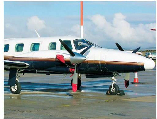
Piper Cheyenne IIXL Prop Tie/Exhaust Covers, Intake Plugs