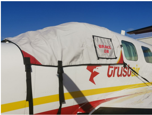
Piper PA-42 Cheyenne III Cockpit Cover

This cover type is made from Silver Acrylic Sunbrella canvas and is 100% lined with a soft and smooth microfiber. Bruce's Custom Covers developed this material combination especially for aircraft protection. The outer material is medium weight and treated for water resistance, UV resistance and anti-static buildup. The inner lining is a very soft and smooth microfiber to prevent scratching. The material is very reflective, and tests show that the cabin interior temperature can be reduced to near-ambient temperature on the hottest of days. It is water, ice and snow repellent, yet breathable to allow moisture to escape from between the cover and the aircraft surface.