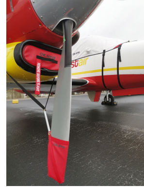
Piper PA-42 Cheyenne III Cockpit Cover, Prop Tie/Exhaust Cover, Inlet Plugs