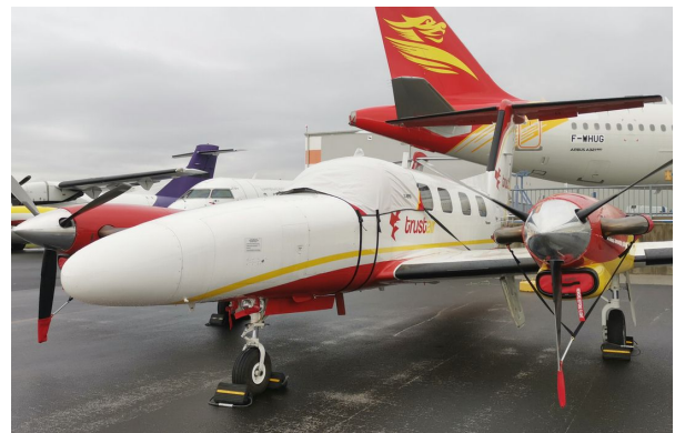
Piper PA-42 Cheyenne III Cockpit Cover, Prop Tie/Exhaust Cover, Inlet Plugs