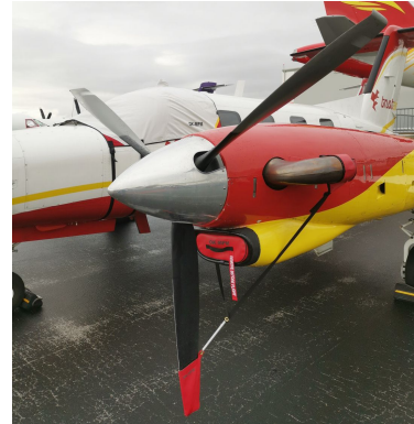
Piper PA-42 Cheyenne III Prop Tie/Exhaust Cover, Inlet Plugs