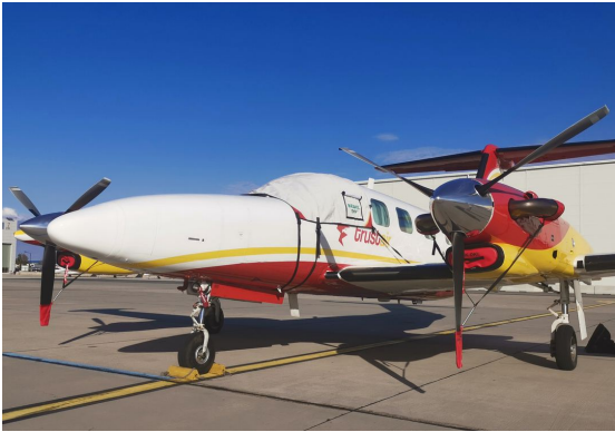
Piper PA-42 Cheyenne III Engine Plugs, Prop Ties, Cockpit Cover

This cover type is made from Silver Acrylic Sunbrella canvas and is 100% lined with a soft and smooth microfiber. Bruce's Custom Covers developed this material combination especially for aircraft protection. The outer material is medium weight and treated for water resistance, UV resistance and anti-static buildup. The inner lining is a very soft and smooth microfiber to prevent scratching. The material is very reflective, and tests show that the cabin interior temperature can be reduced to near-ambient temperature on the hottest of days. It is water, ice and snow repellent, yet breathable to allow moisture to escape from between the cover and the aircraft surface.