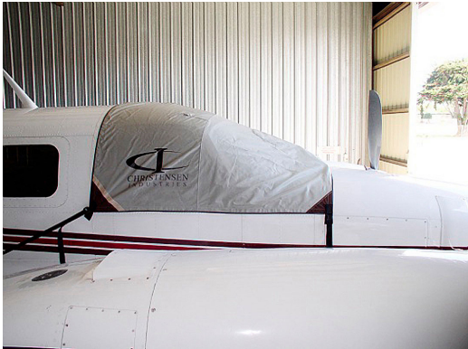
Piper Cheyenne Cockpit Cover