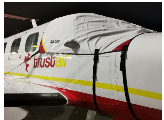
Piper PA-42 Cheyenne III Cockpit Cover