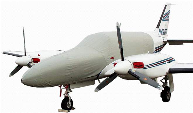
Piper Navajo CR Canopy/Nose Cover

This cover type is made from Silver Acrylic Sunbrella canvas and is 100% lined with a soft and smooth microfiber. Bruce's Custom Covers developed this material combination especially for aircraft protection. The outer material is medium weight and treated for water resistance, UV resistance and anti-static buildup. The inner lining is a very soft and smooth microfiber to prevent scratching. The material is very reflective, and tests show that the cabin interior temperature can be reduced to near-ambient temperature on the hottest of days. It is water, ice and snow repellent, yet breathable to allow moisture to escape from between the cover and the aircraft surface.