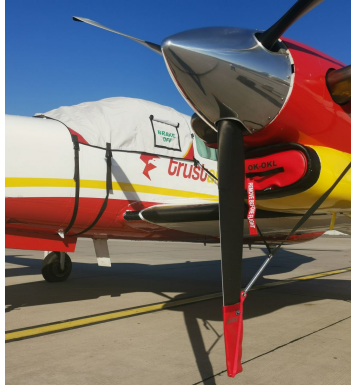
Piper PA-42 Cheyenne III Engine Plugs, Prop Ties, Cockpit Cover

Engine Inlet Plugs are custom fit for your Piper PA-42 Cheyenne III intakes, made with heavy-duty vinyl material, and stuffed with a single block of sculpted urethane foam. Each plug has a zipper that allows the foam to be removed and dried if necessary. Engine plugs have warning flags that are visible from the cockpit or 'remove before flight' streamers sewn onto the face of the plugs. Most plugs are imprinted with the aircraft registration number in black for an extra charge. Storage bag NOT included. Engine plugs may be inserted after flight when the engine is still warm. Engine Inlet Plugs are commonly referred to as Cowl Plugs, Intake Plugs, Cowl Blocks, Engine Blocks, and Engine Bungs.