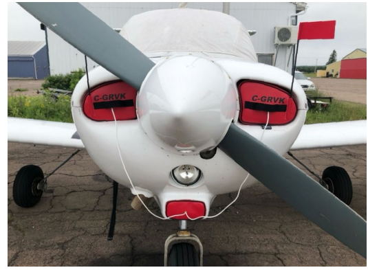
Piper PA-38 Tomahawk Engine Plugs