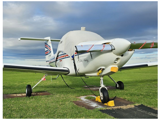
Piper PA-38 Tomahawk Canopy Cover