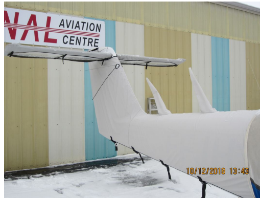
Piper PA-38 Tomahawk Empennage Cover (Tailboom, Vertical & Horiz Stabilizers) Set (W/Horiz. Stab. Cover), Winter Use

WINTER USE MATERIAL - Made with Solution-Dyed Polyester fabric, this option is intended for seasonal use to aid in deicing, rain mitigation, or for occasional travel. The material is lighter and more compact, but more susceptible to UV damage and may have a shorter useful life if used continuously outside than the all-year use material.