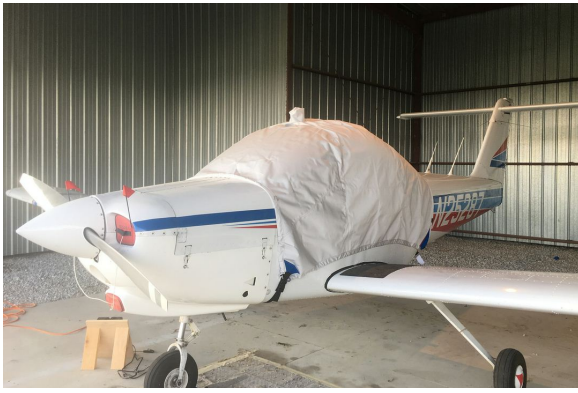
Piper PA-38 Canopy Cover