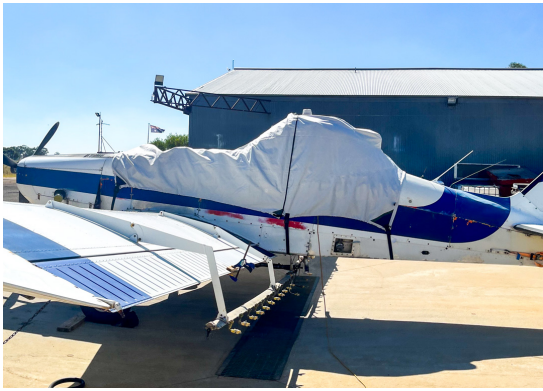
Brave PA-36 Canopy/Hopper Cover