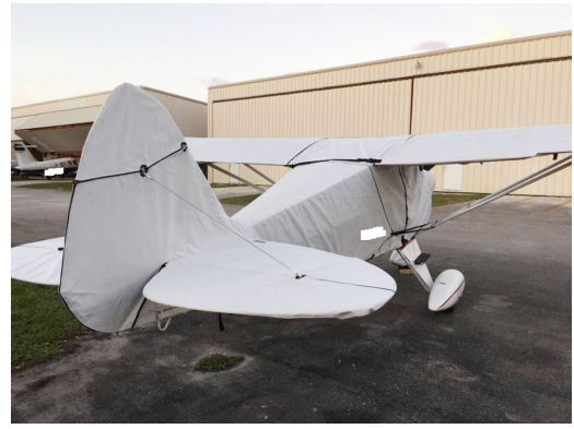
Piper PA-20 Complete Cover Set