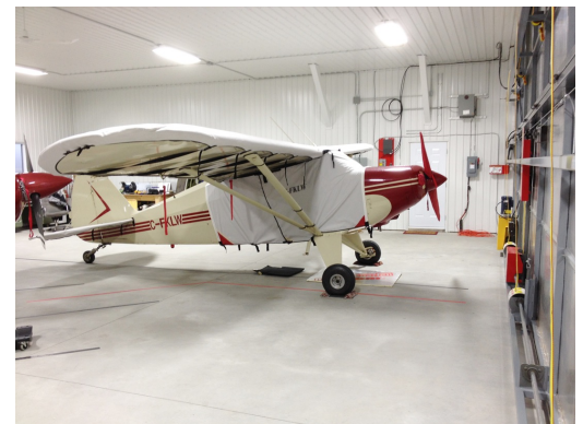
Piper Pacer Travel Cover, Light Weight Travel Canopy Cover (Wrap-Around) Piper PA-20 Extended Canopy Cover, Wing Covers