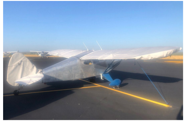
Piper PA-20-135 Wing & Empennage Covers