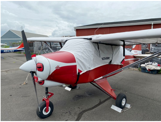
Piper Tri-Pacer PA22-150 Canopy & Wing Covers, Engine Plugs