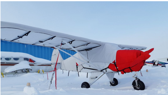
1957 PA-22-150 Over the Top Style Canopy Cover

This cover type is made from Silver Acrylic Sunbrella canvas and is 100% lined with a soft and smooth microfiber. Bruce's Custom Covers developed this material combination especially for aircraft protection. The outer material is medium weight and treated for water resistance, UV resistance and anti-static buildup. The inner lining is a very soft and smooth microfiber to prevent scratching. The material is very reflective, and tests show that the cabin interior temperature can be reduced to near-ambient temperature on the hottest of days. It is water, ice and snow repellent, yet breathable to allow moisture to escape from between the cover and the aircraft surface.