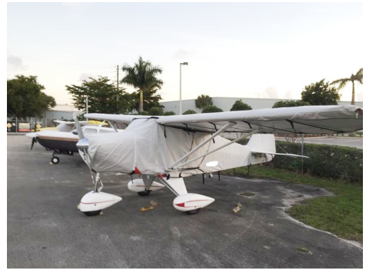
Piper PA-20 Complete Cover Set