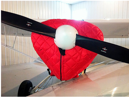
Piper PA-18 Super Cub Insulated Engine Cover