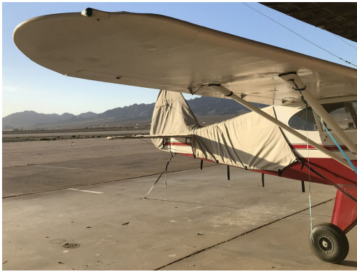
Piper PA-20 Tri-Pacer Empennage Cover