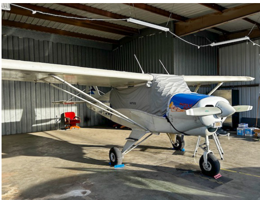
Piper PA-22-150 Travel Canopy Cover

Travel Covers are made with Silver Solution-Dyed Polyester fabric and only lined over the windshield to save weight. The material is lightweight and more compact for easy stowage in the aircraft. The polyester material is water resistant, but only intended for occasional use outside. We also have an ultra lightweight material available for fitted hangar dust covers. For daily outdoor use, the non-travel Sunbrella Cover is the best choice.