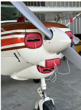
Piper PA-22-150 Engine Inlet Plugs

Engine Inlet Plugs are custom fit for your Piper Clipper, Pacer, Tri-Pacer, Vagabond, Colt: PA-15, 16, 20, 22 intakes, made with heavy-duty vinyl material, and stuffed with a single block of sculpted urethane foam. Each plug has a zipper that allows the foam to be removed and dried if necessary. Engine plugs have warning flags that are visible from the cockpit or 'remove before flight' streamers sewn onto the face of the plugs. Most plugs are imprinted with the aircraft registration number in black for an extra charge. Storage bag NOT included. Engine plugs may be inserted after flight when the engine is still warm. Engine Inlet Plugs are commonly referred to as Cowl Plugs, Intake Plugs, Cowl Blocks, Engine Blocks, and Engine Bungs.