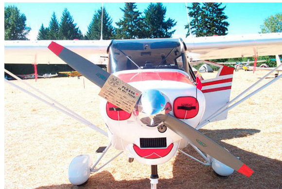
Piper Tri-Pacer Engine Inlet Plugs