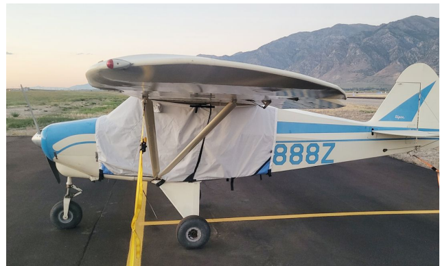
Piper PA-22 Colt Extended Canopy Cover