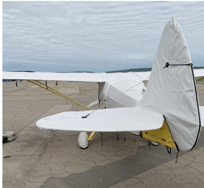
Piper PA-22 Tri-Pacer Empennage Cover

ALL-YEAR USE MATERIAL - Made with Silver Acrylic Sunbrella canvas, the all-year use material is the best option for sun protection and cover longevity. This heavier more durable material is intended for all weather conditions, such as rain and snow or lots of sun.