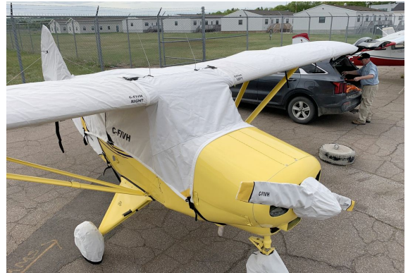
Piper PA-22 Tri-Pacer Cover Set