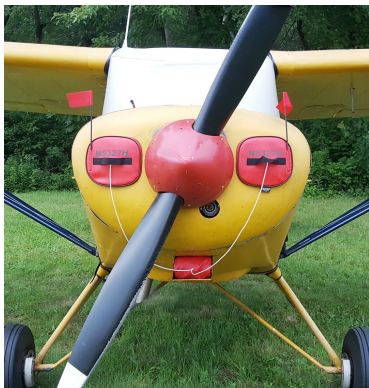
Piper PA-20 Engine Inlet Plugs

Engine Inlet Plugs are custom fit for your Piper Clipper, Pacer, Tri-Pacer, Vagabond, Colt: PA-15, 16, 20, 22 intakes, made with heavy-duty vinyl material, and stuffed with a single block of sculpted urethane foam. Each plug has a zipper that allows the foam to be removed and dried if necessary. Engine plugs have warning flags that are visible from the cockpit or 'remove before flight' streamers sewn onto the face of the plugs. Most plugs are imprinted with the aircraft registration number in black for an extra charge. Storage bag NOT included. Engine plugs may be inserted after flight when the engine is still warm. Engine Inlet Plugs are commonly referred to as Cowl Plugs, Intake Plugs, Cowl Blocks, Engine Blocks, and Engine Bungs.