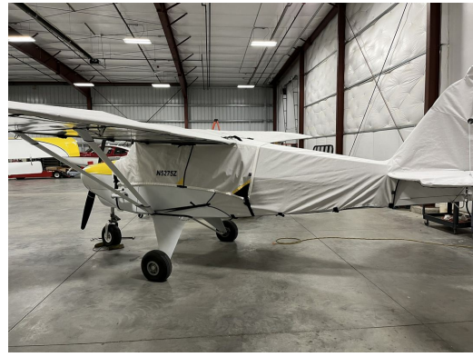
Piper Tri-Pacer Canopy, Wing & Engine Covers