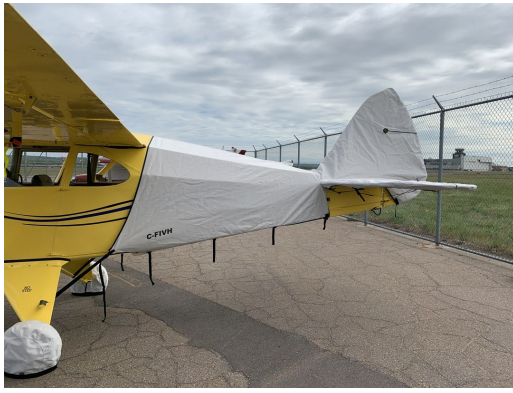
Piper PA-22 Tri-Pacer Empennage Cover