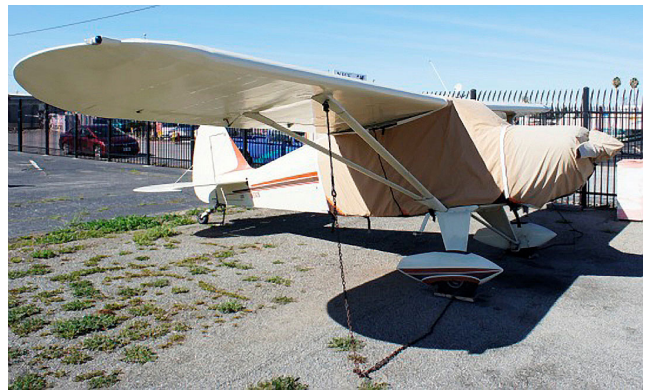
Piper PA-22-150 Pacer Extended Canopy, Engine & Prop/Spinner Covers