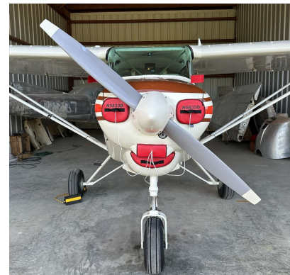
Piper PA-22-150 Engine Inlet Plugs