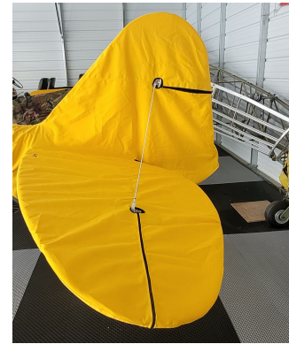
Piper PA-18 Empennage Cover