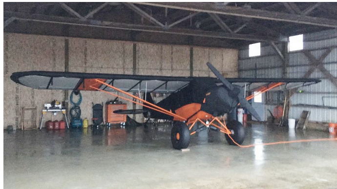
Piper PA-18 Winter Cover Set