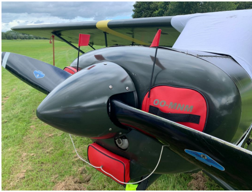
Piper PA-18 Super Cub Engine Plugs