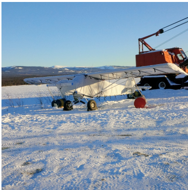
Piper Super Cub Complete Cover Set

This cover type is made from Silver Acrylic Sunbrella canvas and is 100% lined with a soft and smooth microfiber. Bruce's Custom Covers developed this material combination especially for aircraft protection. The outer material is medium weight and treated for water resistance, UV resistance and anti-static buildup. The inner lining is a very soft and smooth microfiber to prevent scratching. The material is very reflective, and tests show that the cabin interior temperature can be reduced to near-ambient temperature on the hottest of days. It is water, ice and snow repellent, yet breathable to allow moisture to escape from between the cover and the aircraft surface.