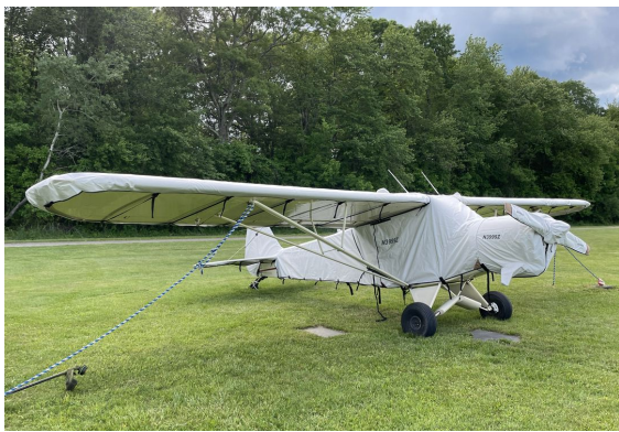
Piper Super Cub Complete Cover Set