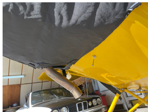
Piper PA-12 Super Cruiser Extended Over-the-Top Canopy Cover & Engine Cover Piper PA-11 Replica Insulated Engine Cover