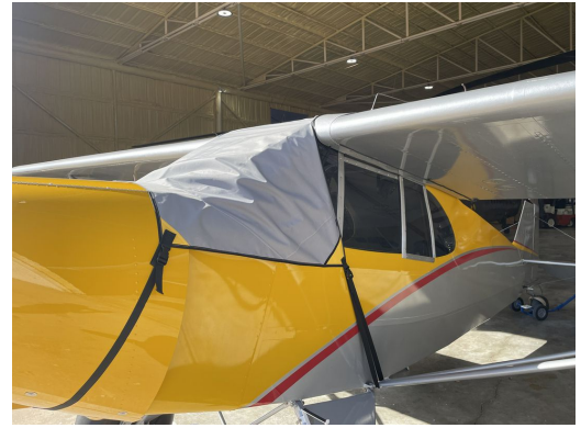
Piper PA-18 Windshield/Skylight Cover