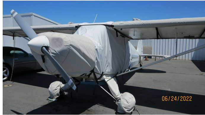
Piper PA-12 Over-Top Canopy Cover, Engine, Wing & Landing Gear Covers