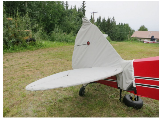
Piper PA-12 Abbreviated Empennage Cover