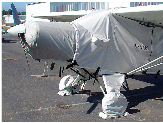
Piper PA-12 Landing Gear Covers