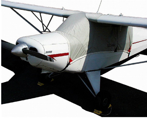
Piper PA-12 Super Cruiser Over-Top Canopy Cover

The material is very reflective, and tests show that the cabin interior temperature can be reduced to near-ambient temperature on the hottest of days. It is water, ice and snow repellent, yet breathable to allow moisture to escape from between the cover and the aircraft surface.