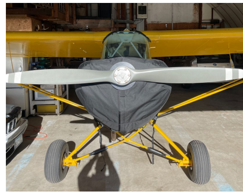
Piper PA-11 Replica Insulated Engine Cover