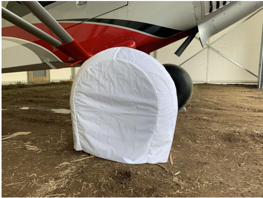
Cub Crafters CC19 Oversize Tire Covers, test fit cover

ALL-YEAR USE MATERIAL - Made with Silver Acrylic Sunbrella canvas, the all-year use material is the best option for sun protection and cover longevity. This heavier more durable material is intended for all weather conditions, such as rain and snow or lots of sun.