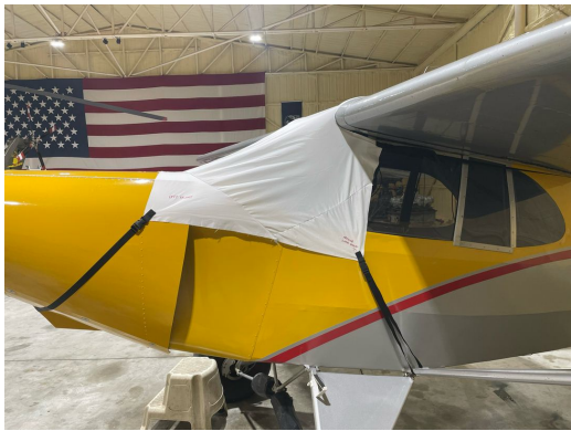
Piper J5A Windshield/Skylight Cover, test fit

The material is very reflective, and tests show that the cabin interior temperature can be reduced to near-ambient temperature on the hottest of days. It is water, ice and snow repellent, yet breathable to allow moisture to escape from between the cover and the aircraft surface.