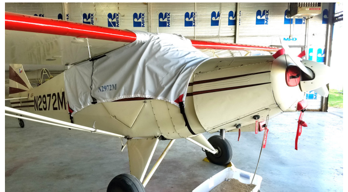
Piper PA-12 Wrap-Around Canopy Cover, Engine Plugs