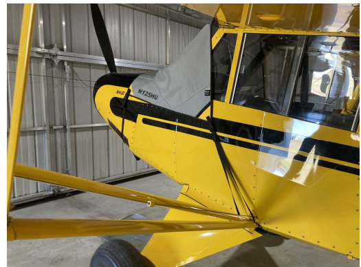
Aviat Husky Windshield/Skylight Cover