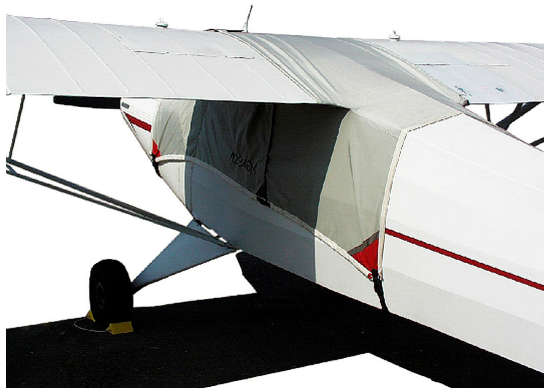
Piper PA-12 Super Cruiser Over-Top Canopy Cover

This cover type is made from Silver Acrylic Sunbrella canvas and is 100% lined with a soft and smooth microfiber. Bruce's Custom Covers developed this material combination especially for aircraft protection. The outer material is medium weight and treated for water resistance, UV resistance and anti-static buildup. The inner lining is a very soft and smooth microfiber to prevent scratching. The material is very reflective, and tests show that the cabin interior temperature can be reduced to near-ambient temperature on the hottest of days. It is water, ice and snow repellent, yet breathable to allow moisture to escape from between the cover and the aircraft surface.