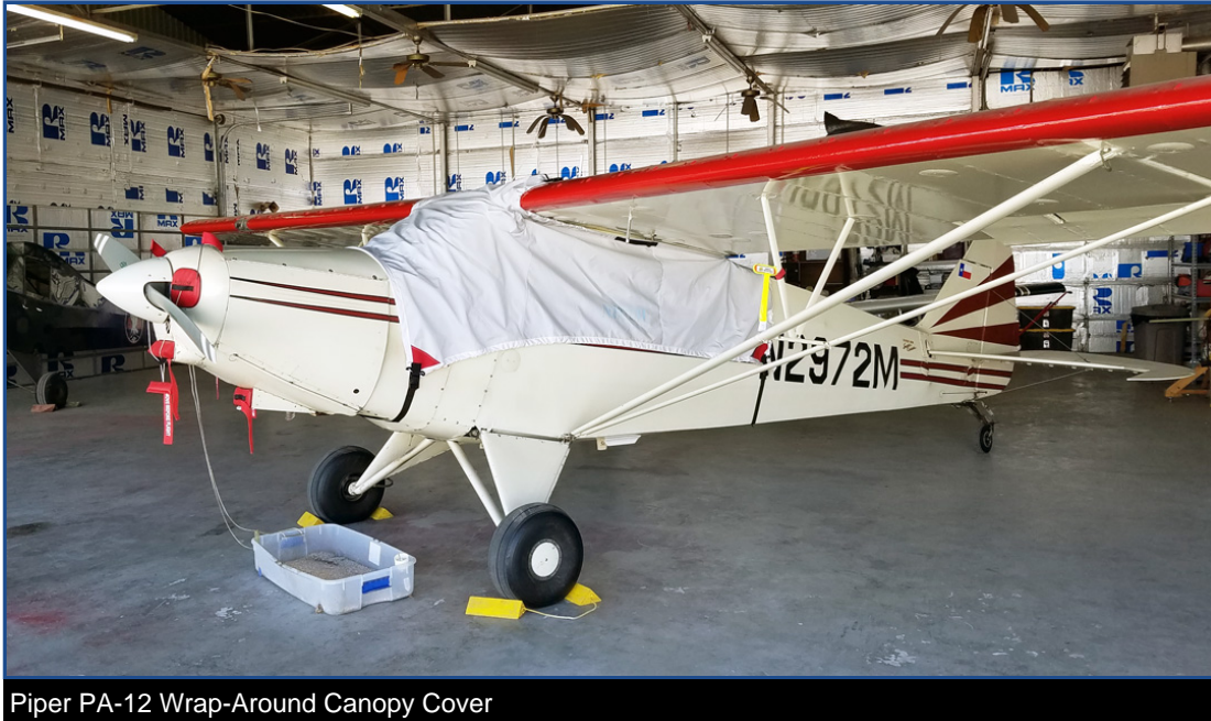
Piper PA-12 Wrap-Around Canopy Cover