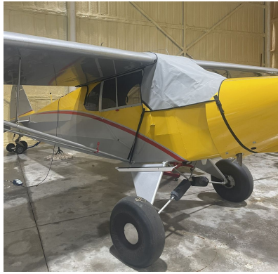
Piper PA-12: Super Cruiser Light Weight Travel Windshield/Skylight Cover

the hottest of days. It is water, ice and snow repellent, yet breathable to allow moisture to escape from between the cover and the aircraft surface.