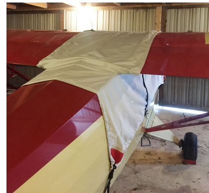
Piper PA-12 Over The Top Style Canopy Cover