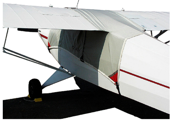
Piper PA-12 Super Cruiser Over-Top Canopy Cover