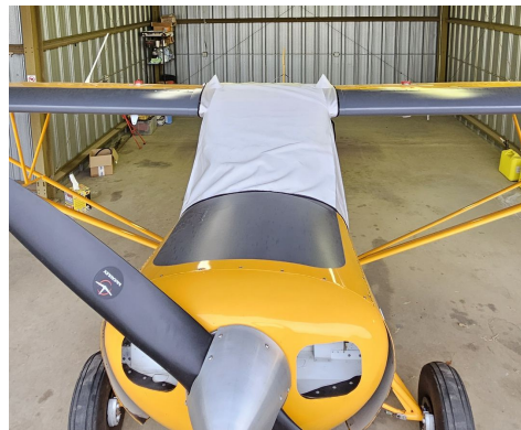
Piper PA-12: Super Cruiser, J5 Cub Windshield/Skylight Cover