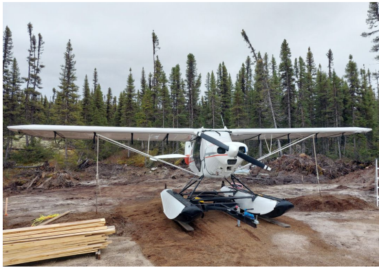
Piper PA-12 Windshield/Skylight & Wing Covers