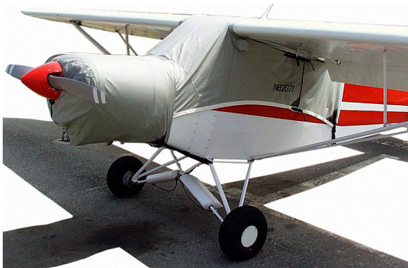
Piper PA-18 Canopy & Engine Covers

This cover type is made from Silver Acrylic Sunbrella canvas and is 100% lined with a soft and smooth microfiber. Bruce's Custom Covers developed this material combination especially for aircraft protection. The outer material is medium weight and treated for water resistance, UV resistance and anti-static buildup. The inner lining is a very soft and smooth microfiber to prevent scratching. The material is very reflective, and tests show that the cabin interior temperature can be reduced to near-ambient temperature on the hottest of days. It is water, ice and snow repellent, yet breathable to allow moisture to escape from between the cover and the aircraft surface.