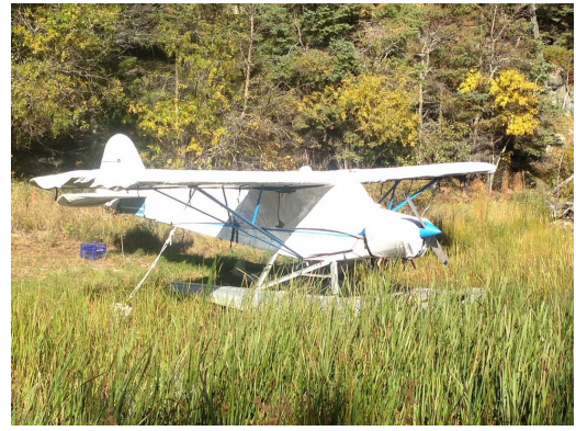
Piper PA-11 Cover Set