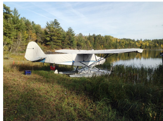
Piper PA-11 Cover Set