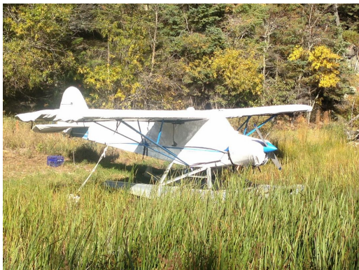
Piper PA-11 Cover Set

This cover type is made from Silver Acrylic Sunbrella canvas and is 100% lined with a soft and smooth microfiber. Bruce's Custom Covers developed this material combination especially for aircraft protection. The outer material is medium weight and treated for water resistance, UV resistance and anti-static buildup. The inner lining is a very soft and smooth microfiber to prevent scratching. The material is very reflective, and tests show that the cabin interior temperature can be reduced to near-ambient temperature on the hottest of days. It is water, ice and snow repellent, yet breathable to allow moisture to escape from between the cover and the aircraft surface.