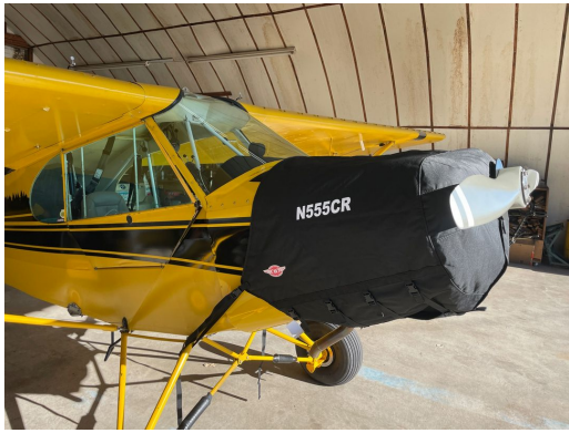
Piper PA-11 Replica Insulated Engine Cover