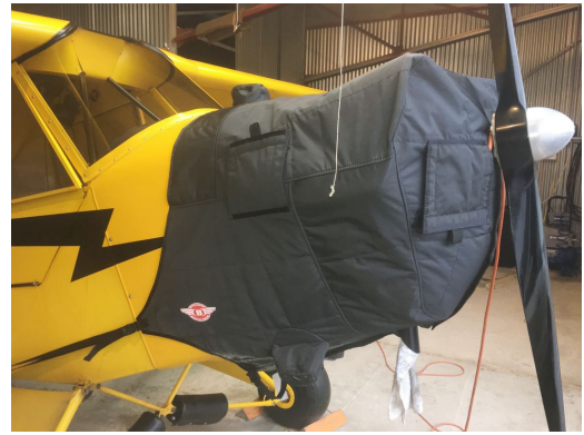
Piper J3 Cub Insulated Engine Cover