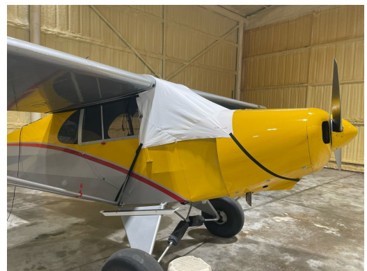
Piper J5A Windshield/Skylight Cover, test fit