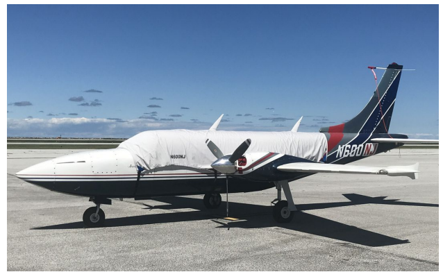
Smith Aerostar 600 Canopy Cover