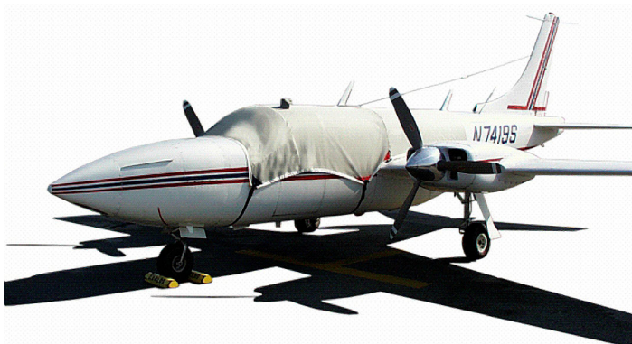
Aerostar Canopy Cover

The Piper PA-601 Aerostar Nose Cover is designed to cover the section of the fuselage forward of the windshield to the tip of the nose. It is secured with belly straps. This cover type is made from Silver Acrylic Sunbrella canvas and is 100% lined with a soft and smooth microfiber. Bruce's Custom Covers developed this material combination especially for aircraft protection. The outer material is medium weight and treated for water resistance, UV resistance and anti-static buildup. The inner lining is a very soft and smooth microfiber to prevent scratching. The material is very reflective, and tests show that the cabin interior temperature can be reduced to near-ambient temperature on the hottest of days. It is water, ice and snow repellent, yet breathable to allow moisture to escape from between the cover and the aircraft surface.