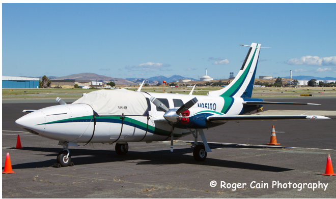
Piper Aerostar Cockpit Cover and Engine Inlet Plugs