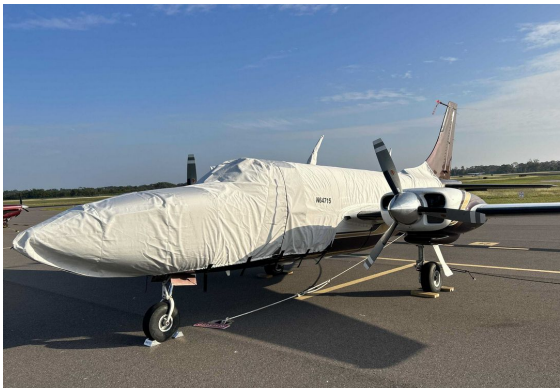
Piper PA-601 Aerostar Fuselage Cover (back to Horiz Stab)

The Piper PA-601 Aerostar Nose Cover is designed to cover the section of the fuselage forward of the windshield to the tip of the nose. It is secured with belly strapsThis cover type is made from Silver Acrylic Sunbrella canvas and is 100% lined with a soft and smooth microfiber. Bruce's Custom Covers developed this material combination especially for aircraft protection. The outer material is medium weight and treated for water resistance, UV resistance and anti-static buildup. The inner lining is a very soft and smooth microfiber to prevent scratching. The material is very reflective, and tests show that the cabin interior temperature can be reduced to near-ambient temperature on the hottest of days. It is water, ice and snow repellent, yet breathable to allow moisture to escape from between the cover and the aircraft surface.