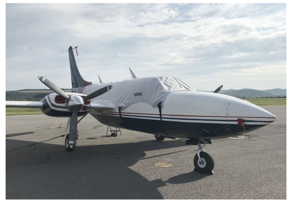
Smith Aerostar 600 Canopy Cover