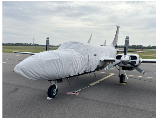
Piper PA-601 Aerostar Fuselage Cover (back to Horiz Stab)