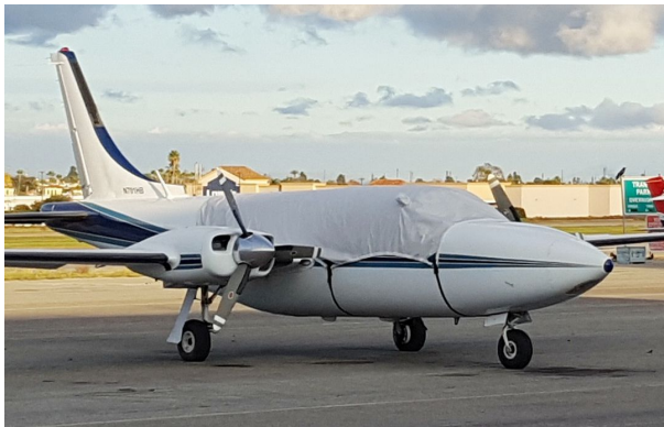
Piper PA-601 Aerostar Canopy Cover (Windows Only)

The Piper PA-601 Aerostar Nose Cover is designed to cover the section of the fuselage forward of the windshield to the tip of the nose. It is secured with belly straps. This cover type is made from Silver Acrylic Sunbrella canvas and is 100% lined with a soft and smooth microfiber. Bruce's Custom Covers developed this material combination especially for aircraft protection. The outer material is medium weight and treated for water resistance, UV resistance and anti-static buildup. The inner lining is a very soft and smooth microfiber to prevent scratching. The material is very reflective, and tests show that the cabin interior temperature can be reduced to near-ambient temperature on the hottest of days. It is water, ice and snow repellent, yet breathable to allow moisture to escape from between the cover and the aircraft surface.