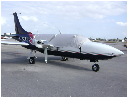
Aerostar Canopy Cover