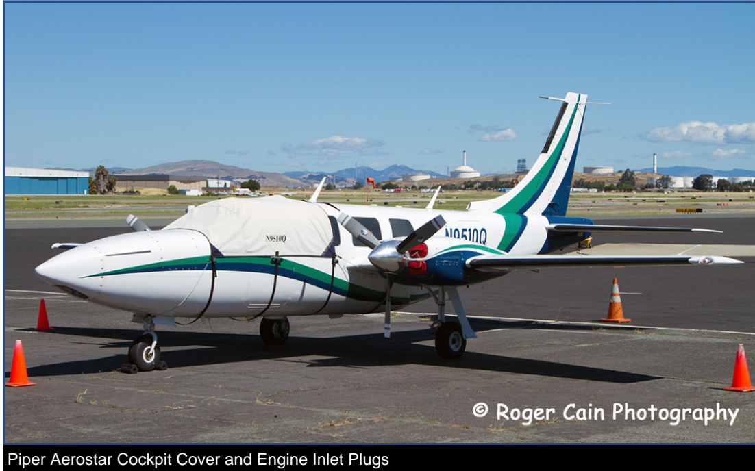
Piper Aerostar Cockpit Cover and Engine Inlet Plugs