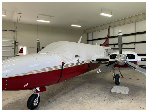
Piper Aerostar PA-60-700P Canopy Cover Windows Only