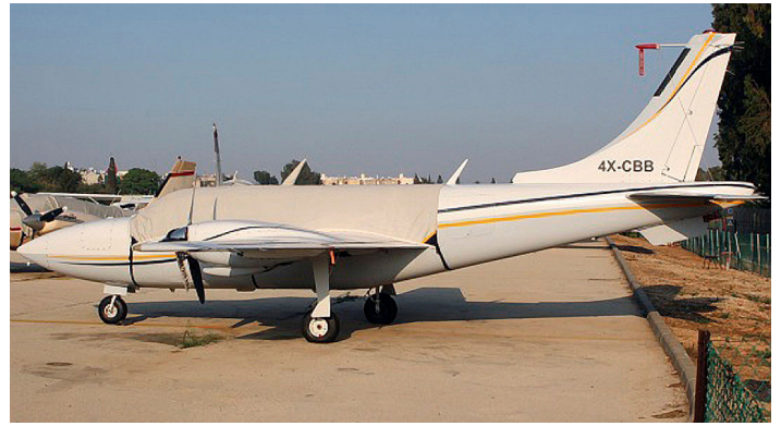
Piper Aerostar Canopy Cover