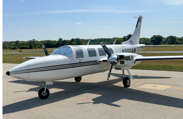
Aerostar 601P Windshield Heatshield

Windshield Heatshields are interior sunshades for an aircraft's front windshield. The product is a unique composite of closed-cell foam with a silver mylar finish. The semi-rigid design is stiff enough to stand along the inside of the windshield using sun visors or window framing. It folds up flat and easily stores in the included storage sleeve. Some designs may require velcro and suction cups or split right and left sides. A Heatshield is an excellent short-term remedy for cockpit overheating. An external fabric cover is far more effective and practical for long-term protection.