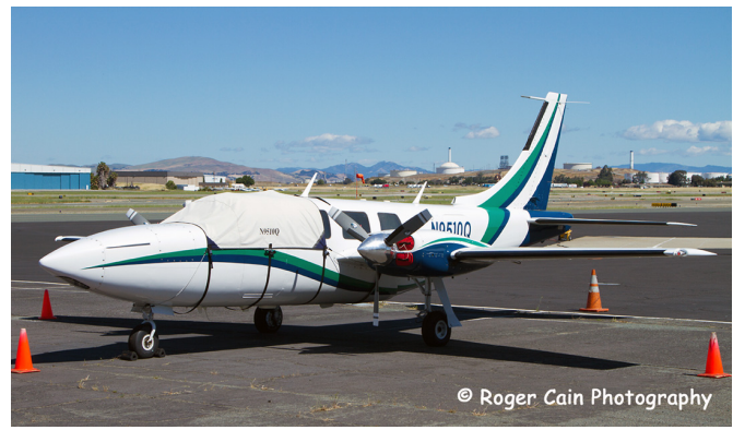
Piper Aerostar Cockpit Cover and Engine Inlet Plugs