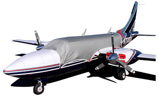
Aerostar Canopy Cover & Plugs