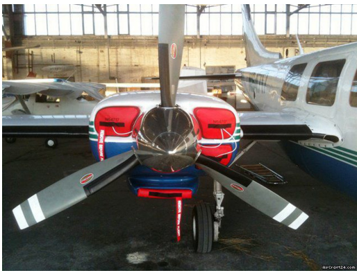
Aerostar Engine Inlet Plugs