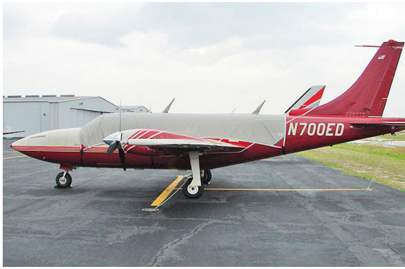
Piper Aerostar Canopy Cover, extended over baggage door