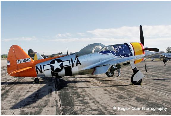
P47D Thunderbolt Canopy Cove