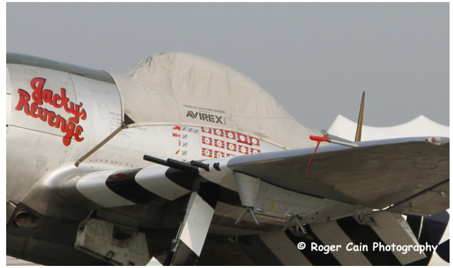
P47D Thunderbolt Canopy Cove