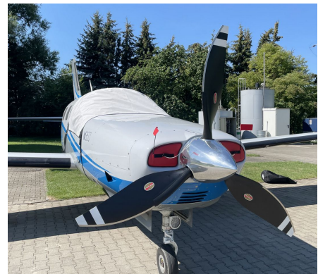
Piper PA-46-350P Cockpit Cover, Engine Plugs