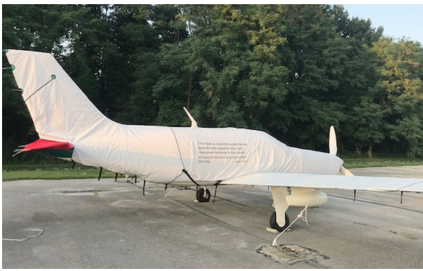
Piper Malibu, Mirage, Meridian Extended Canopy, Engine, Empennage & Wing Covers.