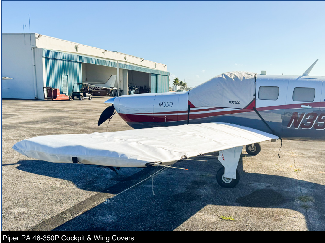
Piper PA 46-350P Cockpit &amp; Wing Covers