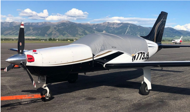
Piper PA46-350P Travel Canopy Cover, Engine Plugs

Travel Covers are made with Silver Solution-Dyed Polyester fabric and only lined over the windshield to save weight. The material is lightweight and more compact for easy stowage in the aircraft. The polyester material is water resistant, but only intended for occasional use outside. We also have an ultra lightweight material available for fitted hangar dust covers. For daily outdoor use, the non-travel Sunbrella Cover is the best choice.