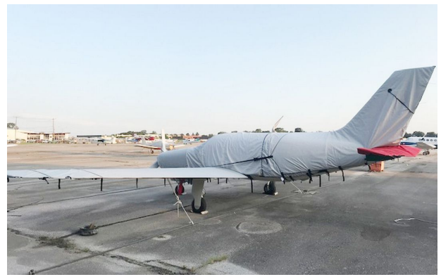
Piper Malibu, Mirage, Meridian Extended Canopy, Engine, Empennage & Wing Covers.