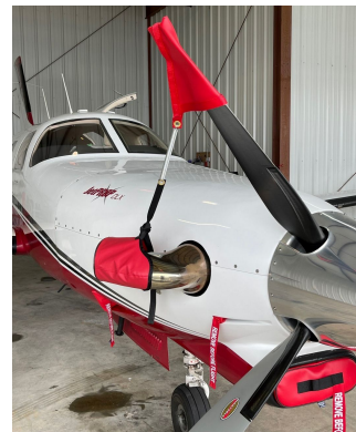
Piper Malibu JetProp Plugs, Prop Tie, Exhaust Covers