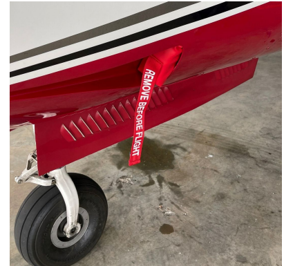
Piper Malibu JetProp Inlet Plug