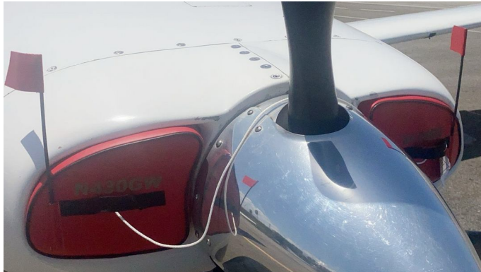
Piper PA-46 Engine Inlet Plugs

Engine Inlet Plugs are custom fit for your Piper PA-46-350P Mirage, Matrix, JetProp intakes, made with heavy-duty vinyl material, and stuffed with a single block of sculpted urethane foam. Each plug has a zipper that allows the foam to be removed and dried if necessary. Engine plugs have warning flags that are visible from the cockpit or 'remove before flight' streamers sewn onto the face of the plugs. Most plugs are imprinted with the aircraft registration number in black for an extra charge. Storage bag NOT included. Engine plugs may be inserted after flight when the engine is still warm. Engine Inlet Plugs are commonly referred to as Cowl Plugs, Intake Plugs, Cowl Blocks, Engine Blocks, and Engine Bunges.