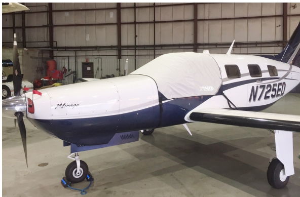
Piper Malibu/Mirage Cockpit Cover, Engine Plugs

This cover type is made from Silver Acrylic Sunbrella canvas and is 100% lined with a soft and smooth microfiber. Bruce's Custom Covers developed this material combination especially for aircraft protection. The outer material is medium weight and treated for water resistance, UV resistance and anti-static buildup. The inner lining is a very soft and smooth microfiber to prevent scratching. The material is very reflective, and tests show that the cabin interior temperature can be reduced to near-ambient temperature on the hottest of days. It is water, ice and snow repellent, yet breathable to allow moisture to escape from between the cover and the aircraft surface.