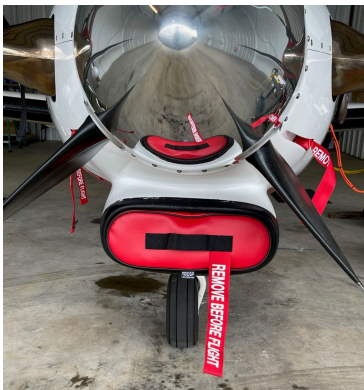
Piper Malibu JetProp Inlet Plugs

This cover type is made from Silver Acrylic Sunbrella canvas and is 100% lined with a soft and smooth microfiber. Bruce's Custom Covers developed this material combination especially for aircraft protection. The outer material is medium weight and treated for water resistance, UV resistance and anti-static buildup. The inner lining is a very soft and smooth microfiber to prevent scratching. The material is very reflective, and tests show that the cabin interior temperature can be reduced to near-ambient temperature on the hottest of days. It is water, ice and snow repellent, yet breathable to allow moisture to escape from between the cover and the aircraft surface.