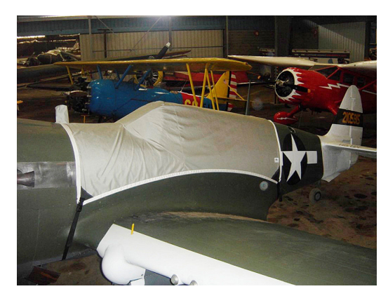
P40 Canopy Cover

Travel Covers are made with Silver Solution-Dyed Polyester fabric and only lined over the windshield to save weight. The material is lightweight and more compact for easy stowage in the aircraft. The polyester material is water resistant, but only intended for occasional use outside. We also have an ultra lightweight material available for fitted hangar dust covers. For daily outdoor use, the non-travel Sunbrella Cover is the best choice.