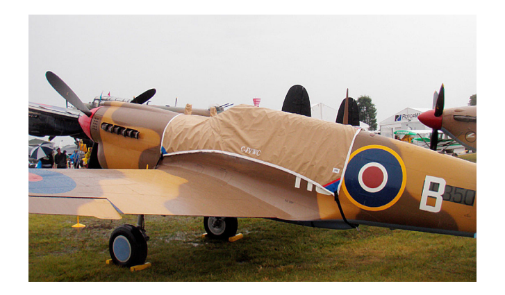
P40 Canopy Cover