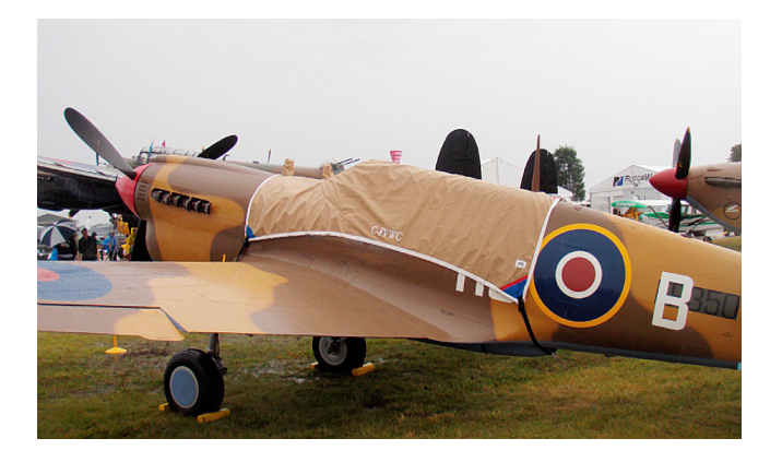
P40 Canopy Cover