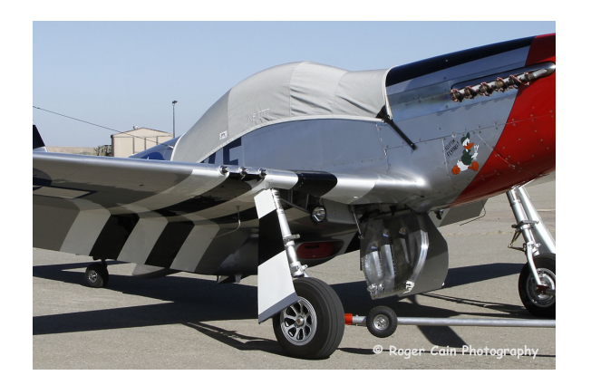
North American P-51 Canopy Cover