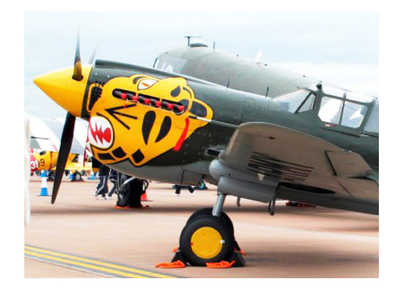
P-40 Warhawk Exhaust Plugs Set

Engine Inlet Plugs are custom fit for your Curtiss P40 Warhawk intakes, made with heavy-duty vinyl material, and stuffed with a single block of sculpted urethane foam. Each plug has a zipper that allows the foam to be removed and dried if necessary. Engine plugs have warning flags that are visible from the cockpit or 'remove before flight' streamers sewn onto the face of the plugs. Most plugs are imprinted with the aircraft registration number in black for an extra charge. Storage bag NOT included. Engine plugs may be inserted after flight when the engine is still warm. Engine Inlet Plugs are commonly referred to as Cowl Plugs, Intake Plugs, Cowl Blocks, Engine Blocks, and Engine Bungs.