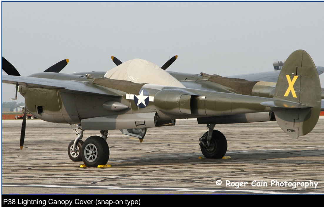
P38 Lightning Canopy Cover (snap-on type)