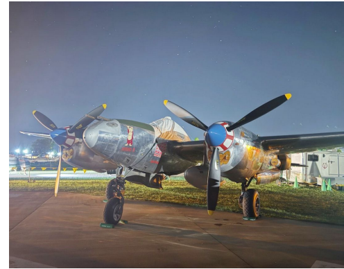
Lockheed P38 Lightning Canopy Cover