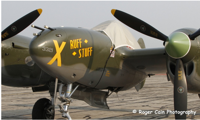
P38 Lightning Canopy Cover (snap-on type)

The material is very reflective, and tests show that the cabin interior temperature can be reduced to near-ambient temperature on the hottest of days. It is water, ice and snow repellent, yet breathable to allow moisture to escape from between the cover and the aircraft surface.