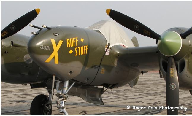
P38 Lightning Canopy Cover (snap-on type)