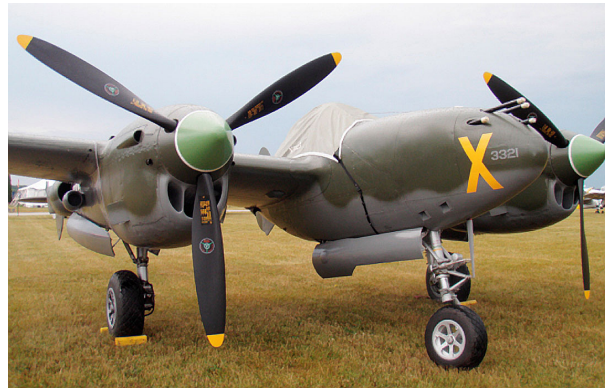
P38 Lightning Canopy Cover (snap-on type)