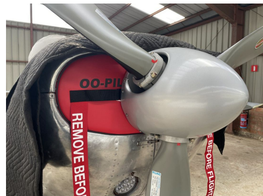
Pilatus P-3 Engine Plugs