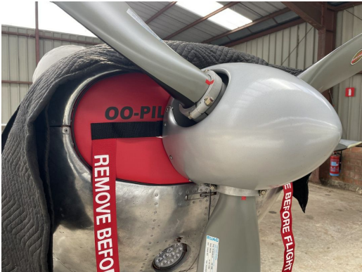
Pilatus P-3 Engine Plugs